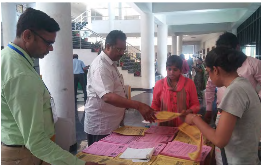
Distribution of awareness materials from stall set up at Ram Manohar Lohiya Law University

amphibians, birds, butterflies, wetlands of Lucknow etc. People from different sectors visited the exhibit and collected posters. Research scholars of the lab spread awareness regarding the role of flora and fauna in our ecosystem using posters.