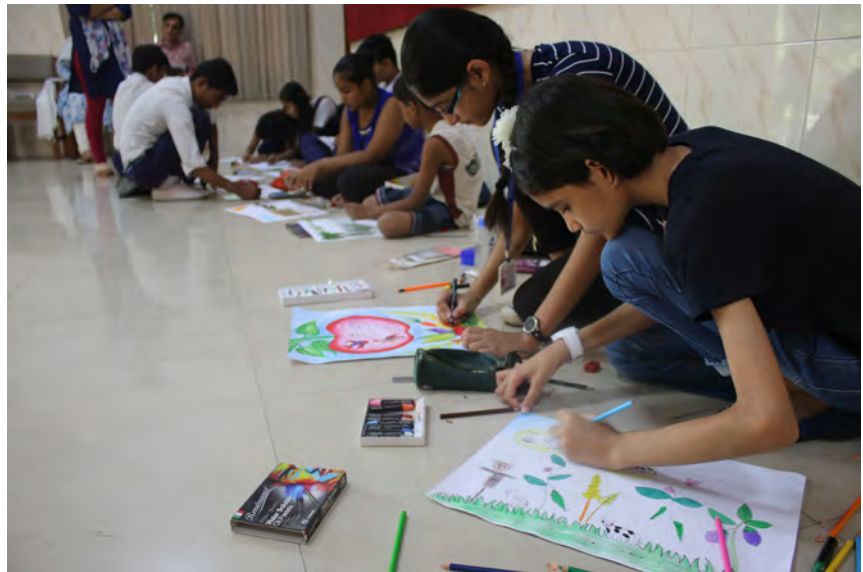
Participants of poster competition

On 20th May 2018 different events were organized at