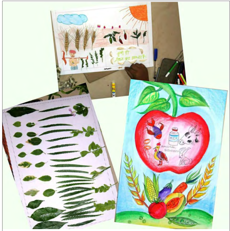
Posters made by the participants