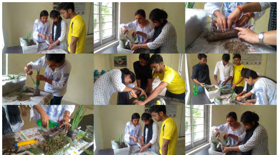
Preparation of flower pots from plastic water bottles