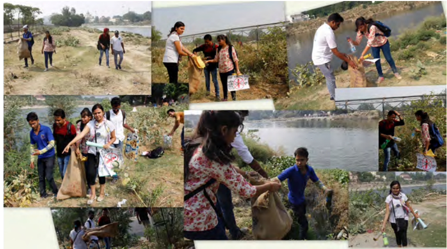
Volunteers collecting the plastic bottles from the selected area of campaign

Awareness activities We have been continuously distributing biodegradable bags and planting trees in the city for the past few years. This year as well we distributed around 200 saplings and 500 paper bags. Volunteers distributed the paper bags to the public and appealed and convinced