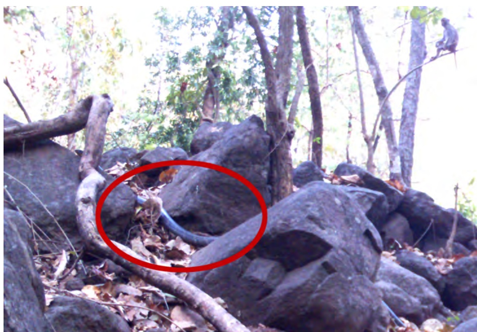
Camera trap picture of King Cobra Ophophagus hannah inside the Papikonda National Park, East Godavari, Andhra Pradesh, India on 17 February 2016