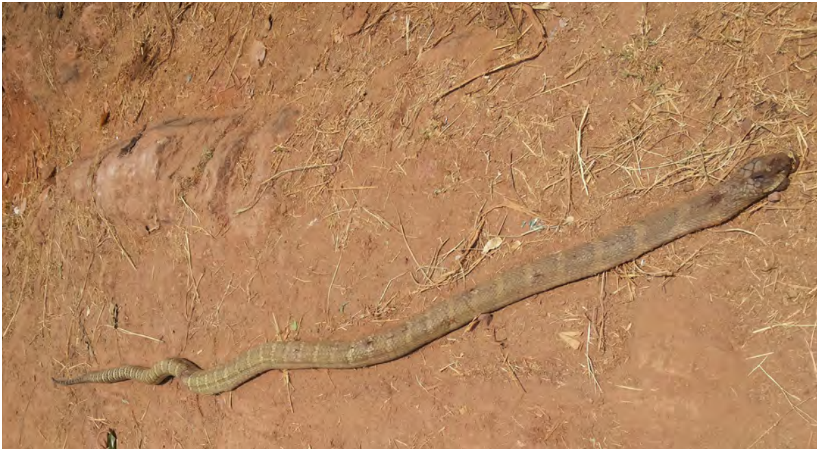
King Cobra Ophiophagus hannah killed by Kothuru and Konthangi villagers of East Godavari, Andhra Pradesh, India on 22 August 2014