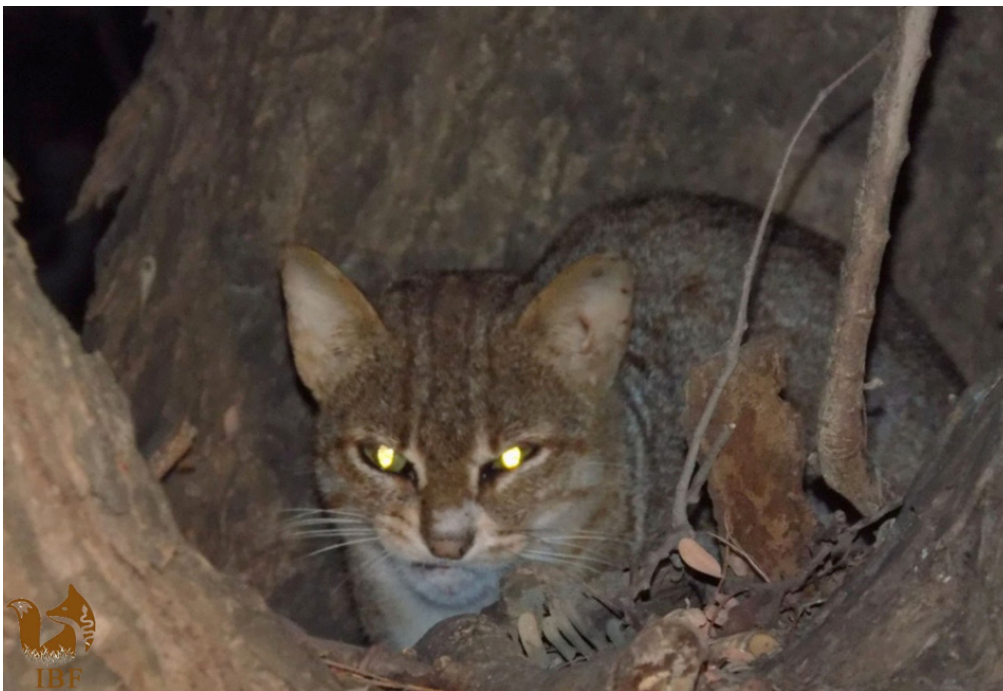
A adult Rusty-spotted Cat on a crotch of Tamarind tree Tamarindus indica .

Rusty-spotted Cat Prionailurus rubiginosus rubiginosus (Geoffroy Saint-Hilaire, 1831) is one of the diminutive felids (Sunquist & Sunquist, 2002) found in India, Nepal and Sri Lanka (Mukherjee et al. 2016). Recently a photographic record has been reported from Bardia National park in Nepal, which extends its distribution range farther to the north (Lamichhane et al. 2016). It is found to be inhabitants of moist and dry deciduous forest, tropical thorn forest, scrub forest, grasslands, arid shrublands, rocky areas and hill slopes (Sunquist & Sunquist 2002), in addition to that, it has been frequently reported