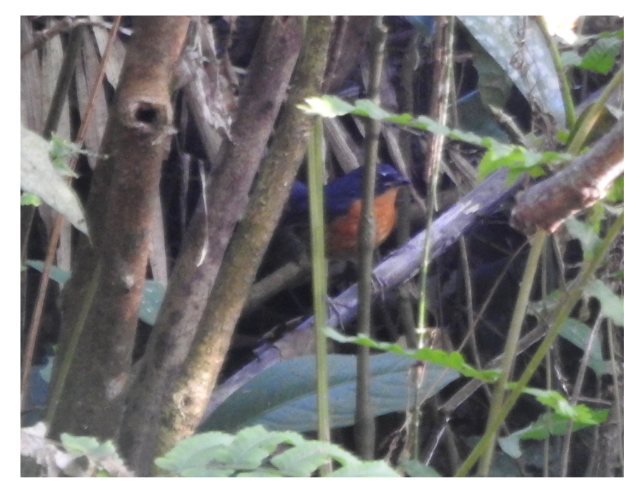
Rusty-bellied Shortwing.

In Assam, the distribution of Rusty-bellied Shortwing is mostly concentrated in the eastern part of Assam, i.e., records of Rusty-bellied Shortwing are mostly from different areas of the three districts of upper Assam, Tinsukia, Dibrugarh and Majuli (eBird 2023). Recently, the Rusty-bellied Shortwing was recorded from the Kuhiabari (27.102 N, 94.109 E) area of