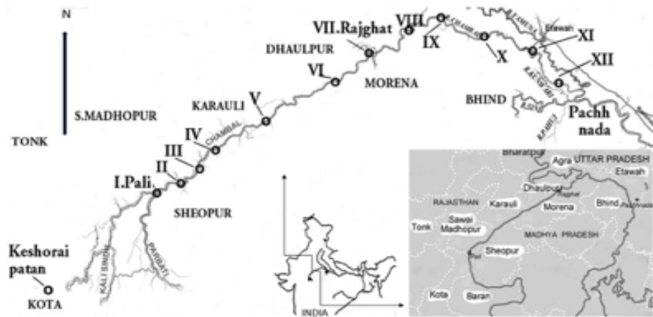
Map of National Chambal Sanctuary showing study zones starting with zone I- Pali to zone XII- Chakarnagar

Common Merganser in NCS is an additional species covered in our bird studies, that has been benefitting from gharial conservation in Chambal. Regular and thorough survey for the species in the state of Madhya Pradesh and other Indian states south of its latitude-longitude is expected to render a clear understanding on migration dynamics of Common Merganser.