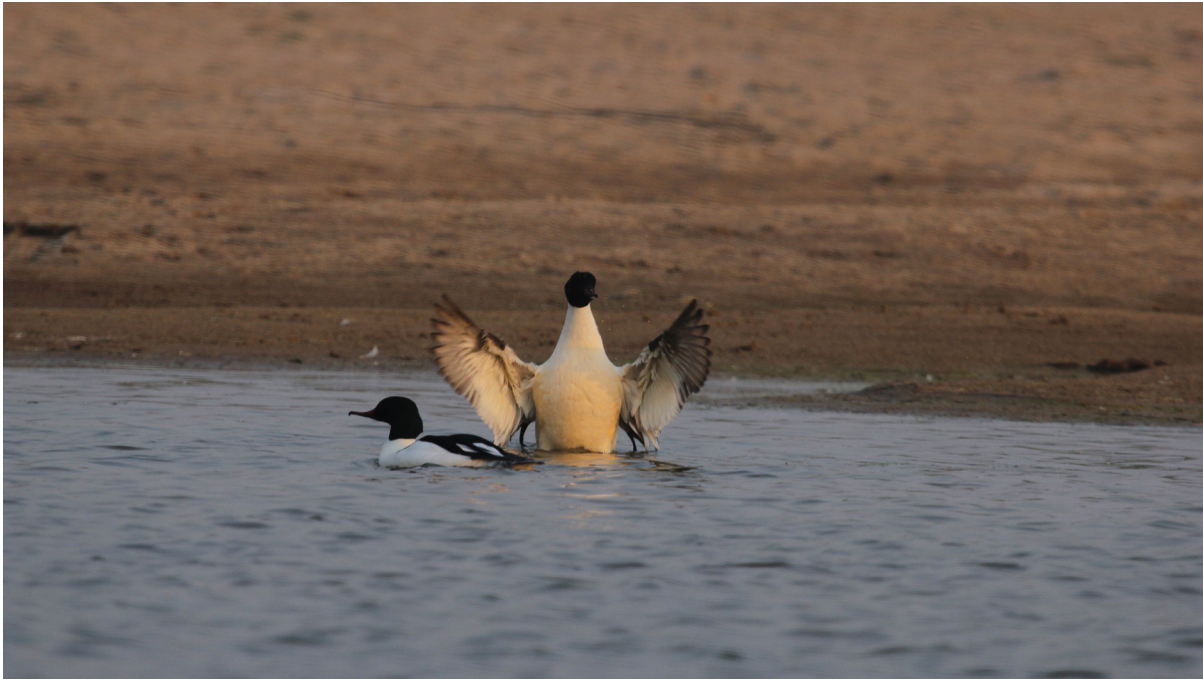
Common Merganser in National Chambal Sanctuary.