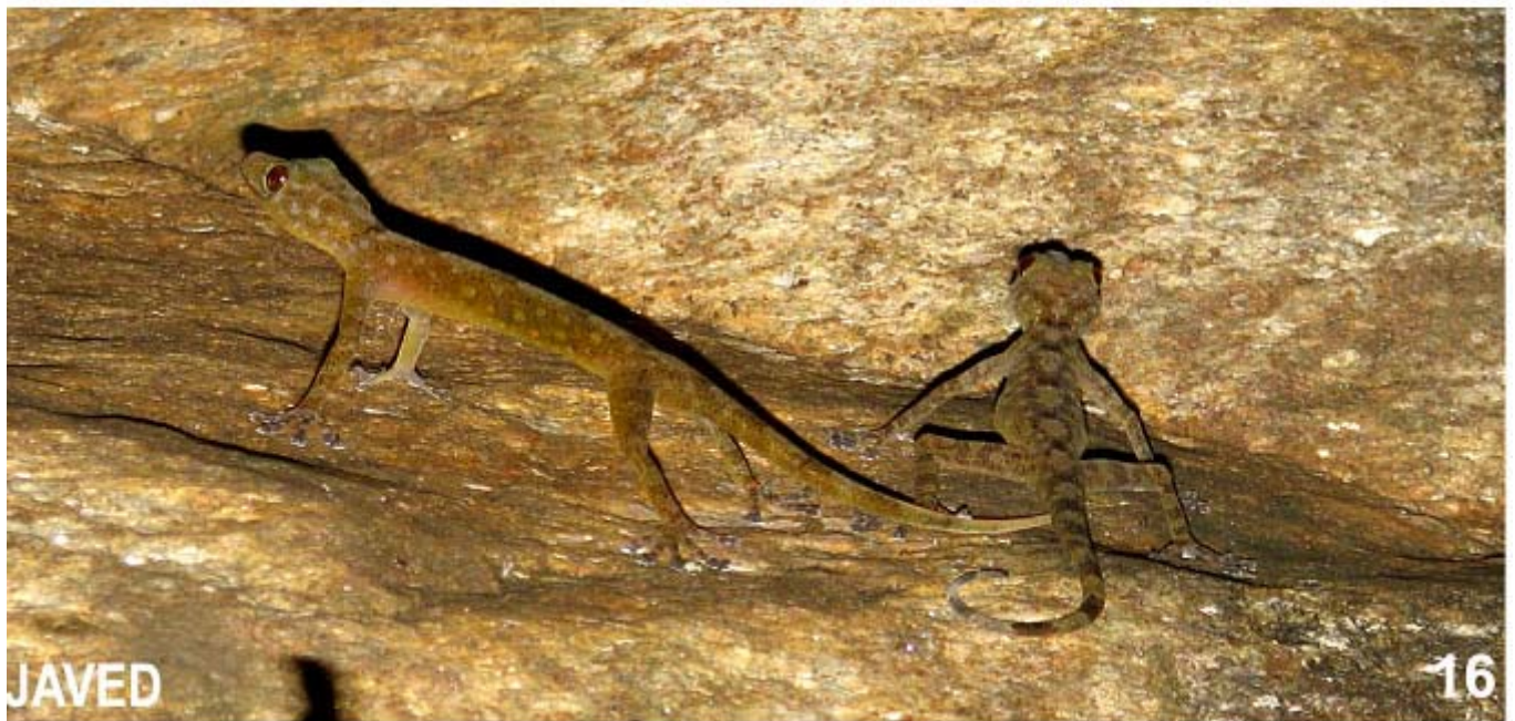
Images 14-16. 14 - Ventral aspect of trunk of Golden Gecko; 15 - Egg site showing Golden Gecko egg cluster on the roof of the boulder; 16 - Territorial display between adult Golden Geckos, showing the arch position