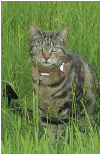
Sage in the grass.