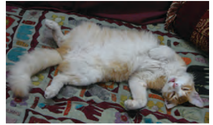
Red Panda lived in India