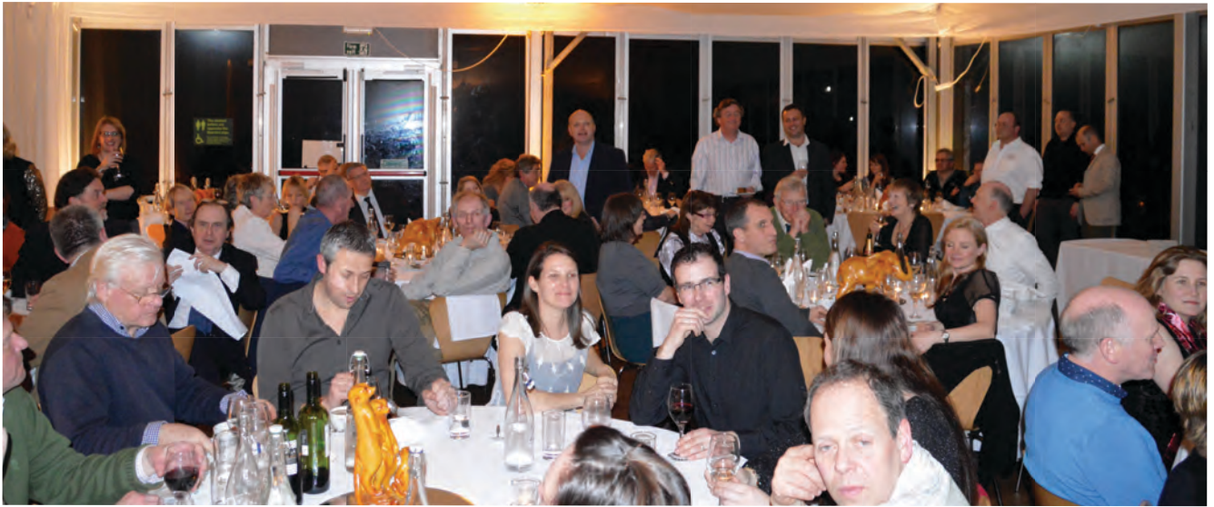
PARTY: About one fourth of the room! A great turn-out for a great person at a great zoo.