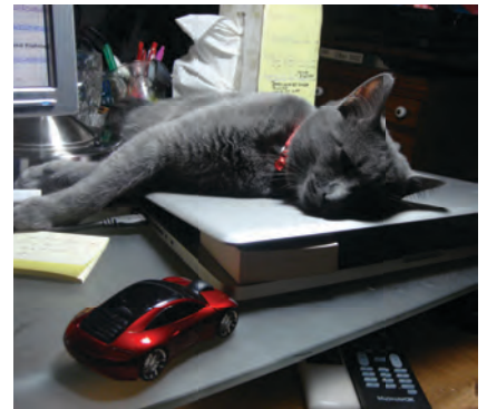
Google likes to sleep on my computer