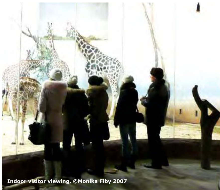
Indoor visitor viewing.

The giraffes have two indoor exhibits with an area of 300 and 105 m 2 and separate boxes totalling 65 m 2 . Outdoors, they can be kept on a paddock of 8500 m 2 together with zebra,gnu, ostrich and antelope, or in an off-view yard of 120 m 2 .