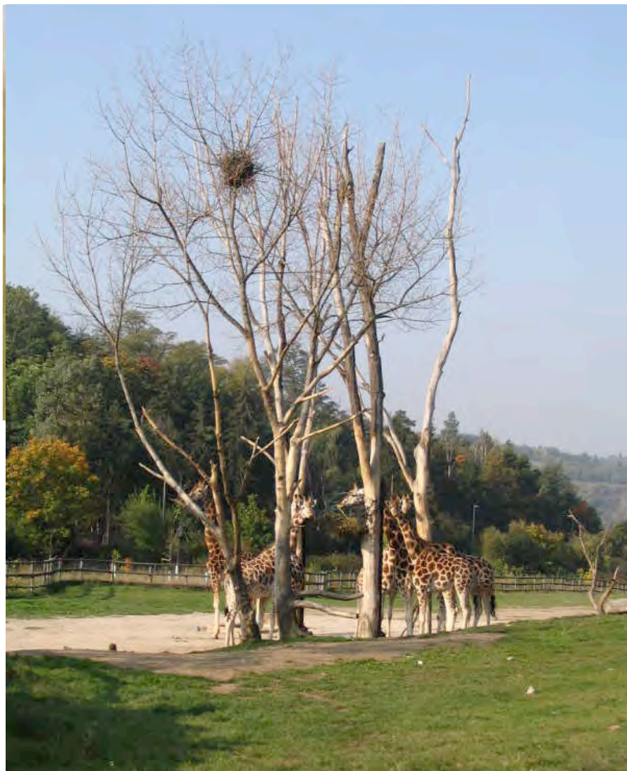
Giraffe feeding.

The facade is made of local timber. The terrace of the pavilion was made from a local sandstone, that is usually removed as a waste because it is not hard enough for other purposes.