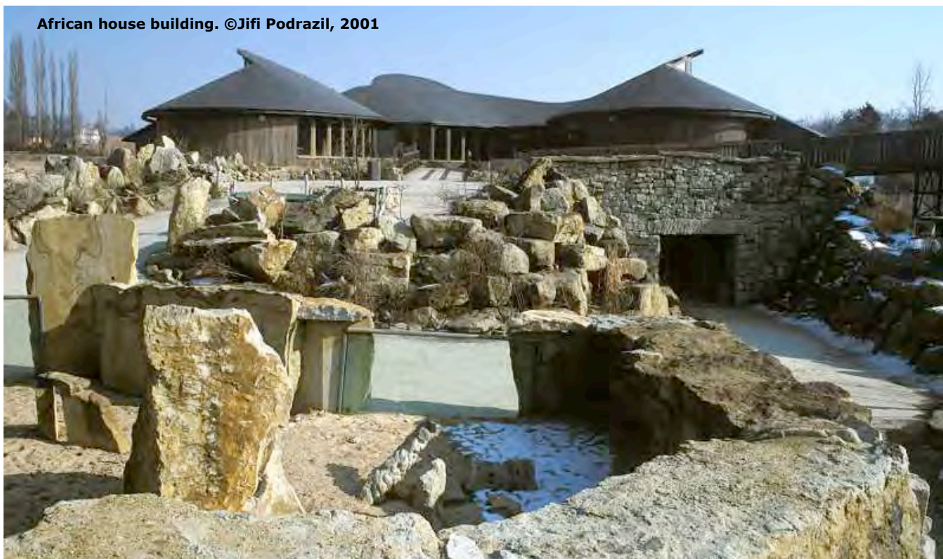
African house building.