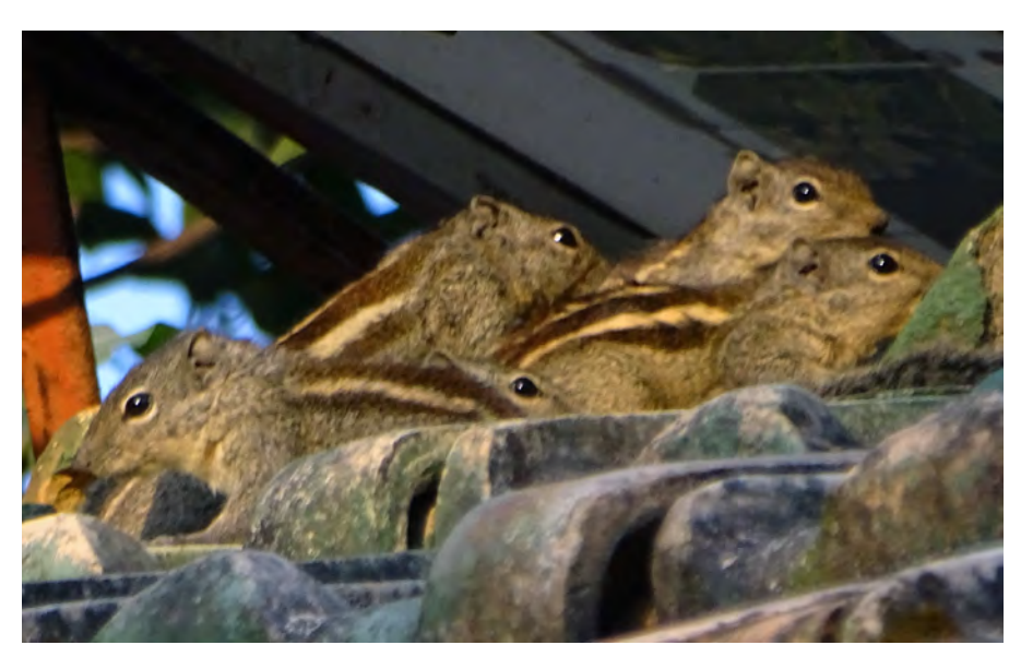
Three-striped palm squirrel observed at Mithibor village near Ratanmahal Wildlife Sanctuary, Dahod District, Gujarat (22°32'24"N & 74°0'2"E; 237m)

much broader range of habitats in northern, central and southern parts of Gujarat (Table). Saurashtra and Kutch regions of Gujarat were not covered in this study and the same need to be done to establish distribution limits of F. palmarum in Gujarat state.