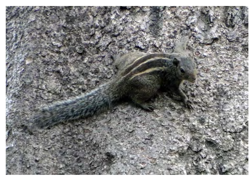
Three-striped palm squirrel near Manchi Haveli, Pavagadh Hill, Panchmahal District, Gujarat (22°28'3"N & 73°31'26"E; 436m)