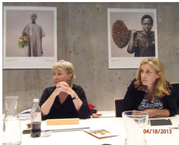
Above Two similar photos of WAZA Council meeting in IUCN HQ meeting rooms. Can you guess which one was taken morning and which one afternoon (late).