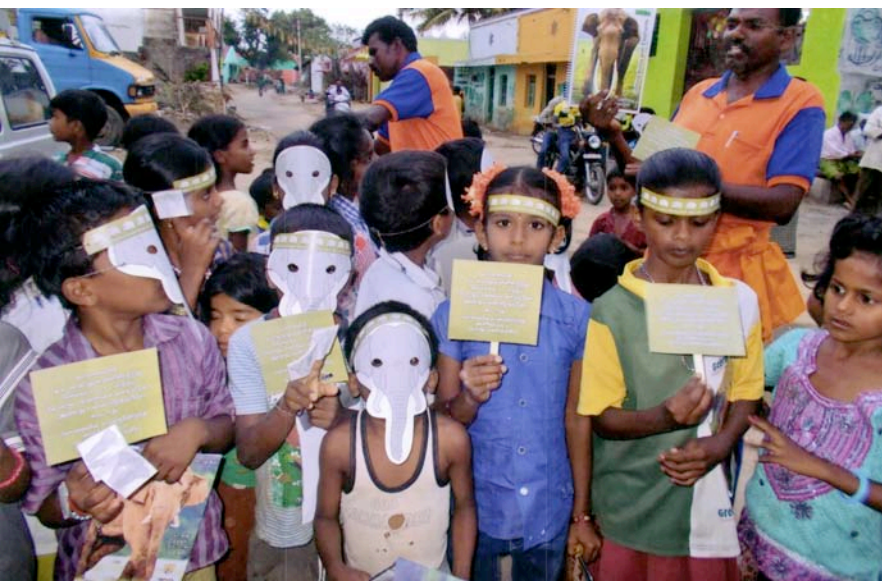
Children posing with ele-kit items at Moramadugu HECx programme