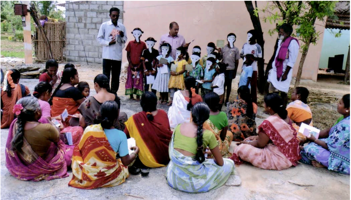
Self help group women members and their children were taught about HECx in Ondiyur programme

and guided the organizers. The Adhiyaman Arts team also involved.