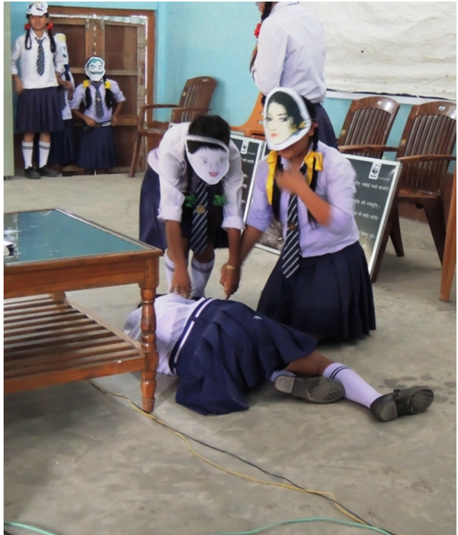
A scene from the HECx drama

To understand the mindset of local communities towards elephants and the related conflict, a simple feedback form was used among the working groups involving students and other participants. Eight such teams responded by filling up those feedback forms. A film by Earth Care on "The Elephants - God or Destroyer" was screened for sharing the experiences of similar conflict incidents across India and the means of mitigation.