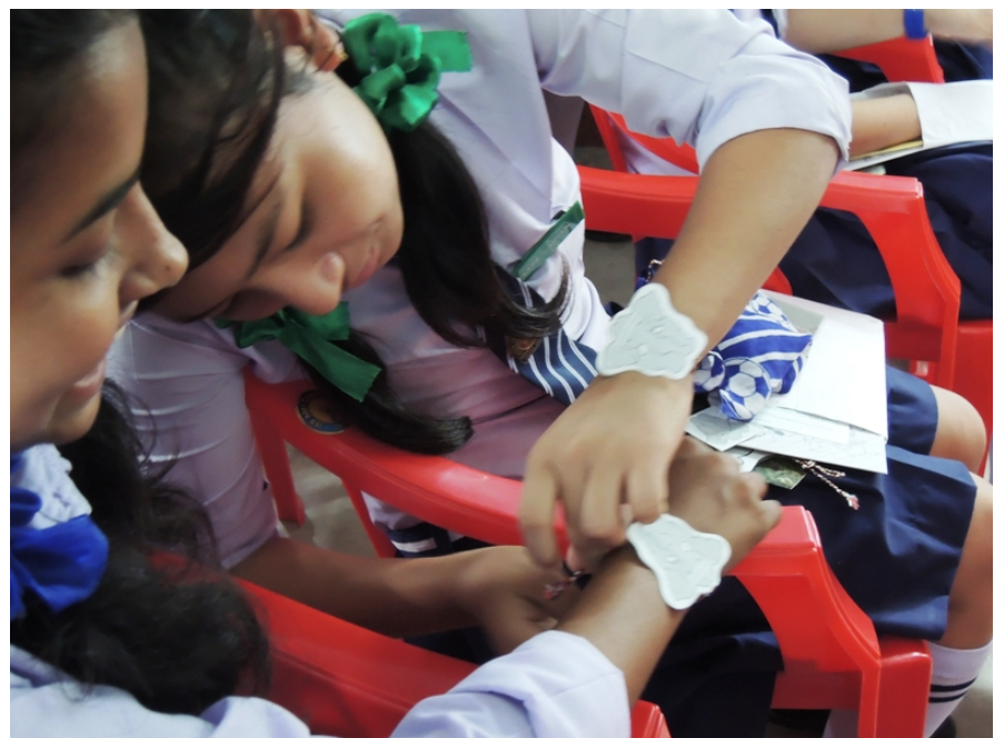
Children tying rakhi with the commitment to coexist with elephants