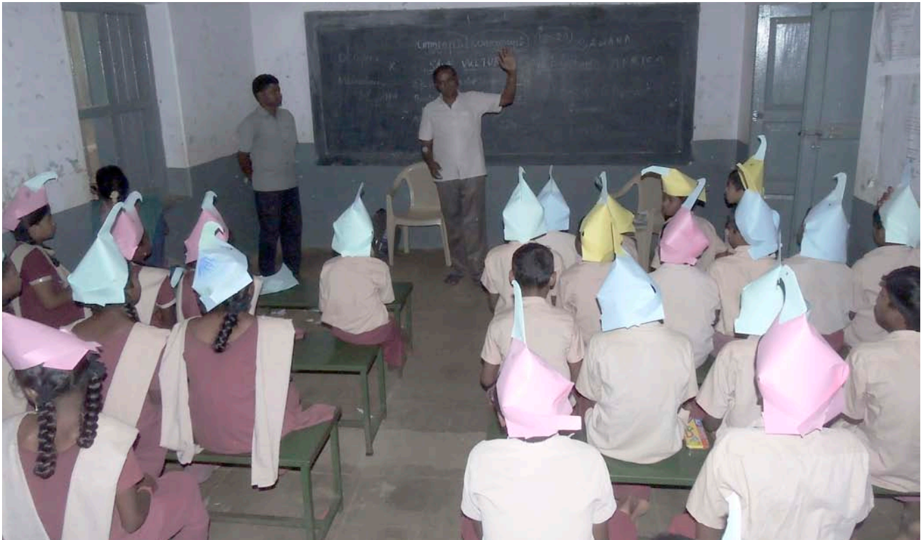
Students were told about the eco-link between elephant and vulture