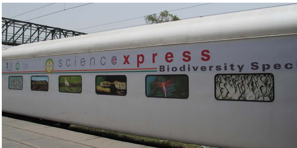
The Brain Train of the Center for Environmental Education.