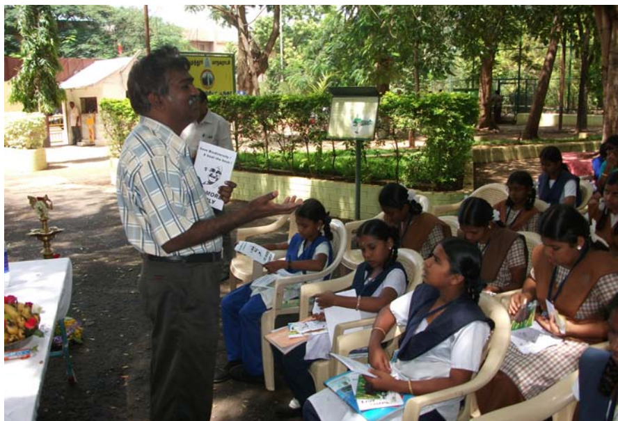
Live more simply programme at VOC park mini zoo during Wildlife Week 2010 for the corporation school students