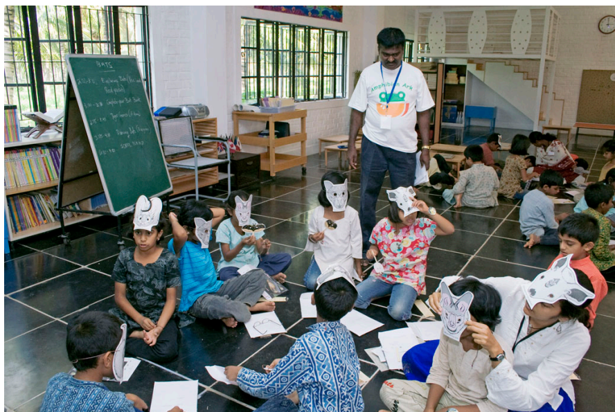
Bat awareness event at the ISHA home school, Coimbatore during wildlife week 2007.

Programme evaluation: The participants will fill an evaluation form both before and after the programme to understand their level of knowledge enhancement and the effectiveness of the programme.