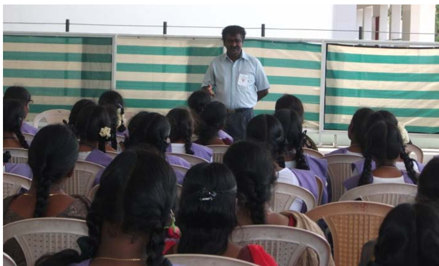
World Environment Day 2011 programme at PSGR Krishnammal School on the theme Forests: Nature at your Service.