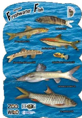
Design 6: Fishes