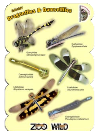
Design 3: Odonates

New cool colours. Order individually or in bulk. T-shirts are subject to availability. We may run out of stock after you have placed your order.