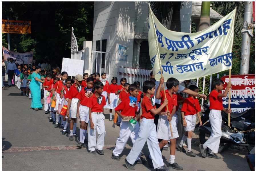
Wildlife awareness rally

Indian Board for Wildlife was started in the year 1952. The board took the decision to start the awareness campaign regarding the wild animals and their conservation by celebrating the wildlife week in 1955. In the week long programmes the masses are given inputs regarding the necessity of wildlife conservation. The awareness programmes are designed in such a way to include all walks of life. The wildlife week is mostly conducted by forest department's wildlife wing and some non government organizations involved in wildlife conservation activities.