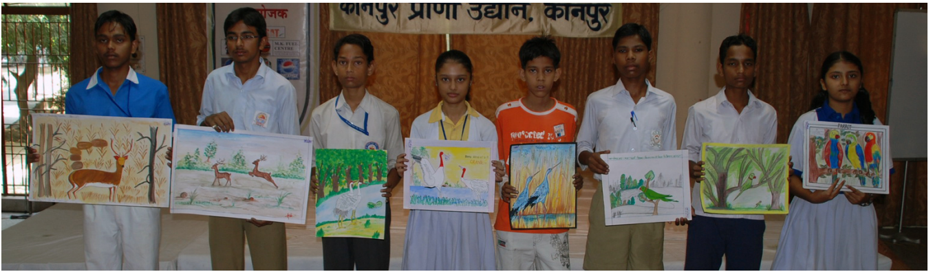
Winners of painting competition

competition a companion also allowed, Rangoli in which the colours filled on the design placed on the ground on a specified animal and its eco system, Painting on a canvas with colours on the wildlife and environment subject etc.,