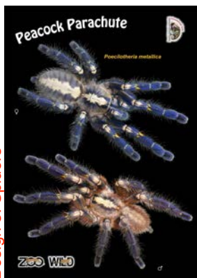
Design 5: Spiders