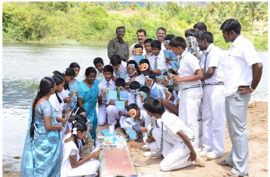
Nalanda Matric. students were taken to study about freshwater biodiversity