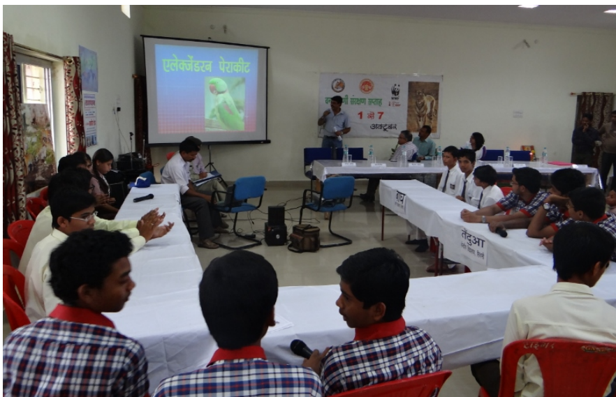
Final round of quiz competition at PTR