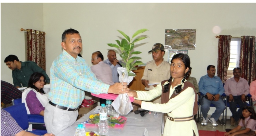
Competition winners were awarded with plant sapling at PTR

shared his wide range of experience with different reptiles of India and abroad with a group of interested participants. Quiz on