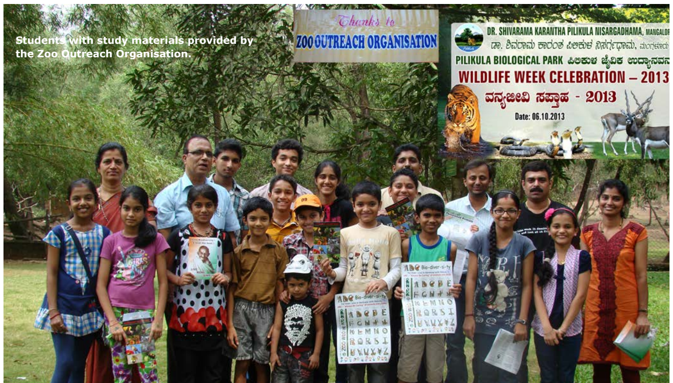
Students with study materials provided by the Zoo Outreach Organisation.