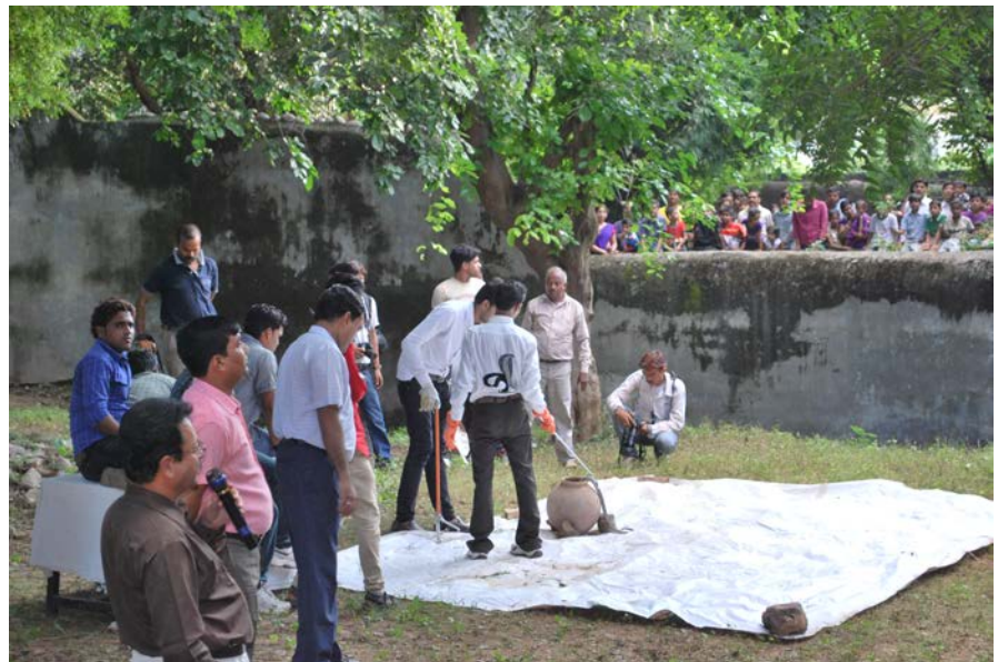
Gandhi Zoological Park organized a snake awareness programme