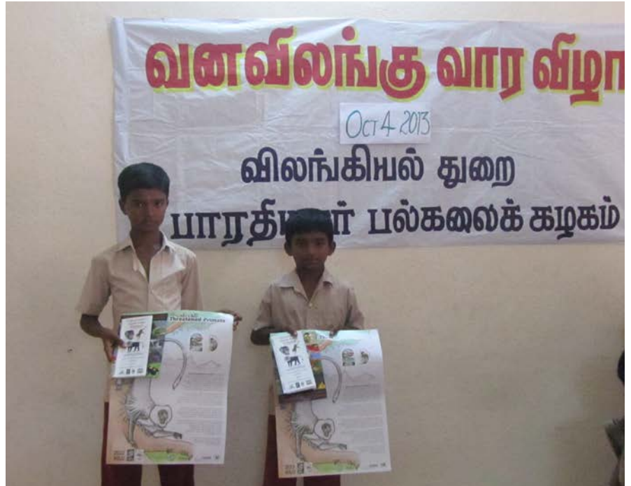
Kalveerampalayam school students with primate poster and pocket guide