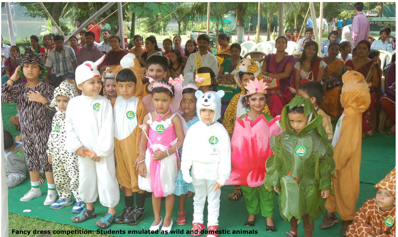
Fancy dress competition: Students emulated as wild and domestic animals