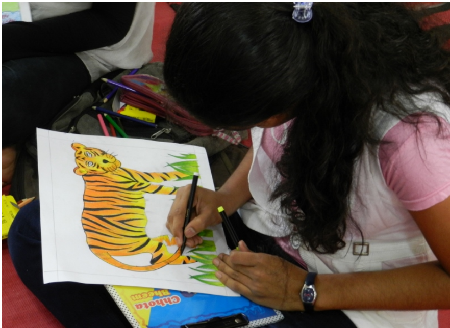
Pench Tiger Reserve conducted drawing competition