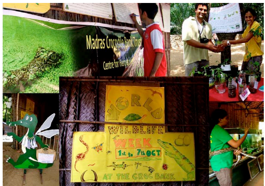
A Collage of the pictures of the programmes

Wildlife week was celebrated at Madras Crocodile Bank Trust from 1-7 October 2013. Since the Joy of Giving Week coincided with Wildlife Week, both themes were combined to create a range of activities. Through these activities Crocodile Bank offered services and materials free of cost to people and students from educational institutions. By