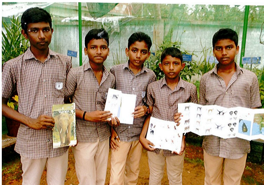
Students with elekit and primate pocket guide at the Calicut program

From 2-8 October Sundarvan organized various activities such as exhibition of wildlife photographs, photography