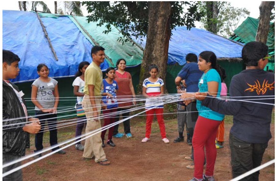
Crysalis school students playing food web game

Twenty students (class 5-7) and two school staff of Crysalis School, Yelehanka, Bangalore were taken to Nandigodu in Shimoga district of Karnataka, which comes under