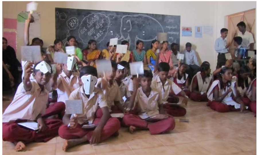
HECx programme at the school