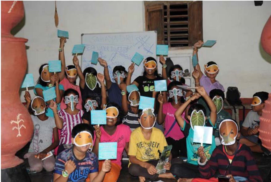
Freshwater biodiversity session