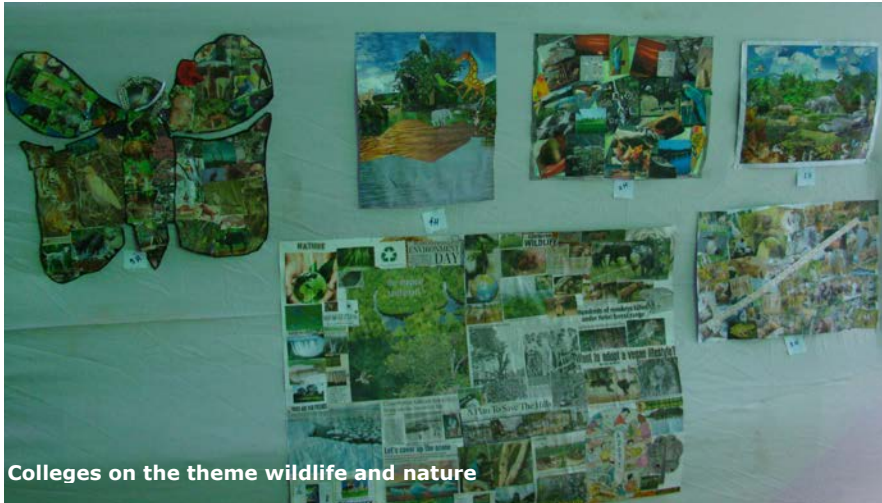
Colleges on the theme wildlife and nature