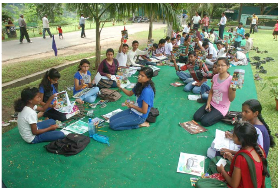
Participants of on the spot drawing competition with education material

animals!". 38 students from 14 different schools participated in both the English and Hindi debate put together. On the 3rd day, an interschool quiz competition was organized in collaboration with Rotary Club of Jamshedpur Steel City on the topic-"Wildlife and Nature Conservation". A total of 54 students from 16 schools took part. The quiz was focused on Tata Steel Zoological Park, Wildlife Sanctuaries and National Parks, wild animals and plants and acts and rules enacted for protection of wildlife in this country.