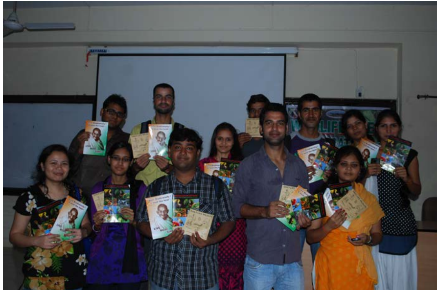
Jiwaji University Zoology students with ZOO materials