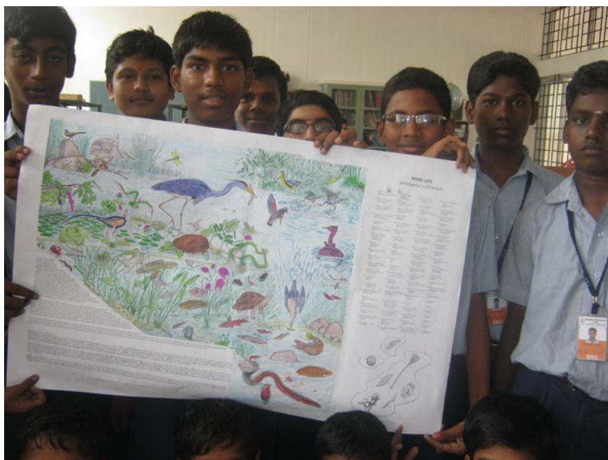
KRS Matric School, Madurai students identified and coloured the pond life

Essay writing competition was organized. Four essays were received from Abacus Montessori School, Chennai. A Croc Fairy was set up where the people coming to visit the zoo could write down a wish to be granted by the Croc fairy . Visitors could make wishes regarding what they would like to see or experience at Crocodile Bank. A set of 12 wishes has been granted. Emails have been sent out informing the recipients how their wishes have been or will be made true. A wishing wall was set up on the back wall of the Young Reptiles booth and visitors were encouraged to write on this wall. Visitors wrote down their thoughts for different questions. Some of