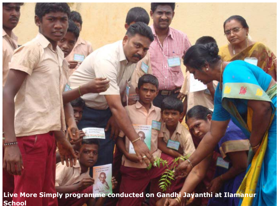
Live More Simply programme conducted on Gandhi Jayanthi at Ilamanur School