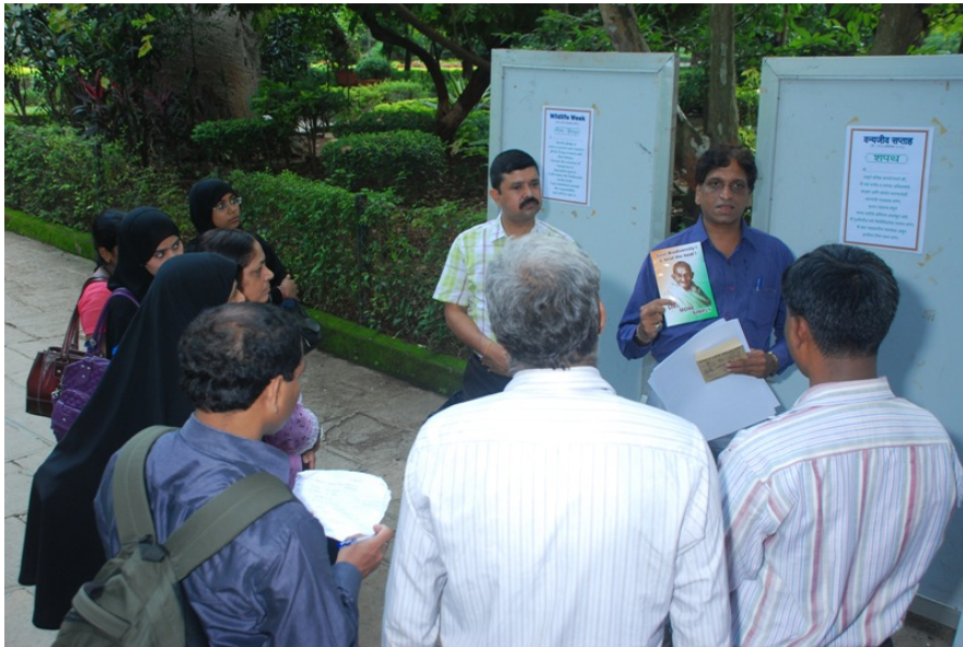
Zoo education kits introduced to the participants