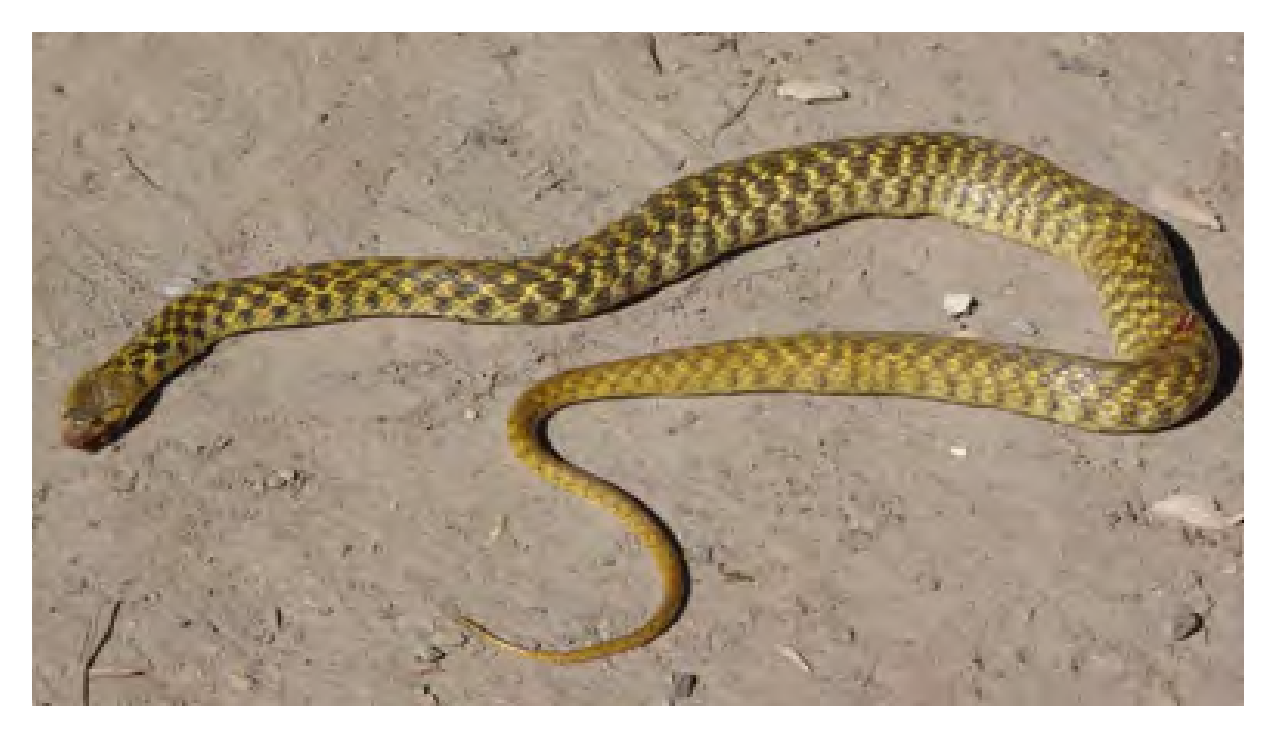
Human kill: Checkered keelback

Mortality of snakes due to vehicular traffic and anthropogenic impacts in Jahangirnagar University campus, Bangladesh