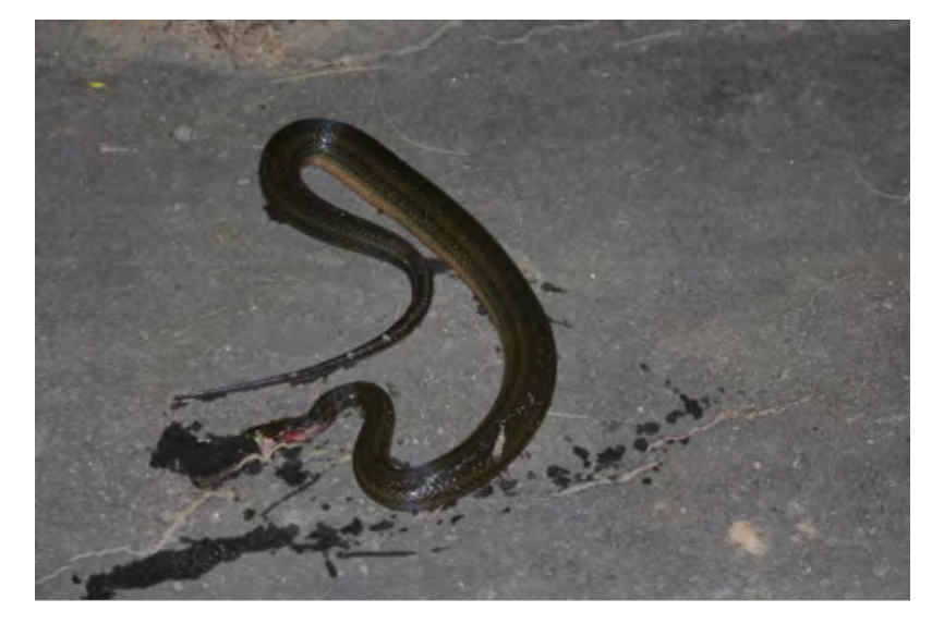
Road kill: Common smooth water snake

The roads passing through University campus