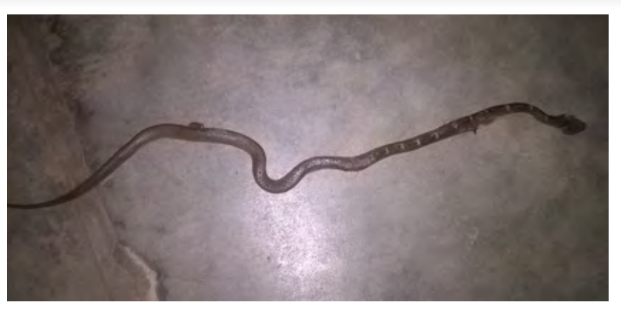
Human kill: Common wolf snake

were divided into five segments (4.24km) for the convenient of study. The roads were systematically searched in early morning (06:00-08:00hrs) and late evening (05:00-07:00hrs) by walking slowly at least three days a week. In addition, using opportunistic