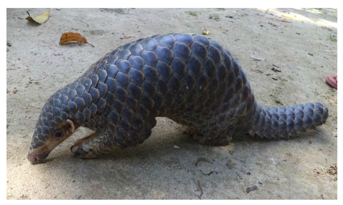
Rescued specimen of Chinese Pangolin ( Manis Pentadactyla ) in Valmiki Tiger Reserve, Bihar, India

IUCN Red List: Critically Endangered (Challender et al., 2014)