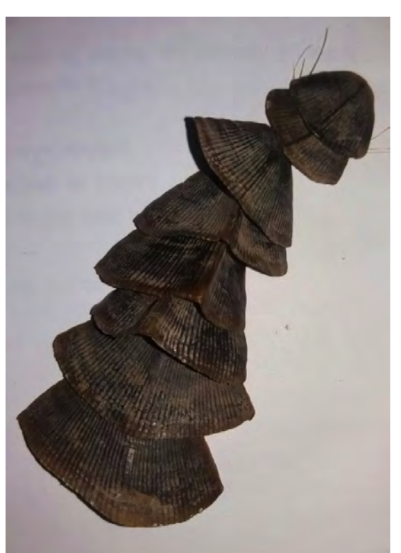
Manis sp. scale was photographed in village nearby Valmiki Tiger Reserve

pangolin photograph was shown to them. Very few were able to distinguish between Chinese & Indian pangolin, and claimed to have seen a pangolin inside forest. Front-line staff of Raghia range has claimed that a pangolin was killed by either tiger or leopard near a water stream in 2013 & 2014. In Nov 2013, two 8-9 months old tiger cubs killed a