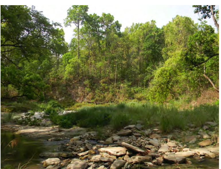
Habitat of Valmiki Tiger Reserve in the Himalayan Foothill

In the present case, a Chinese pangolin was encountered in eastern most part