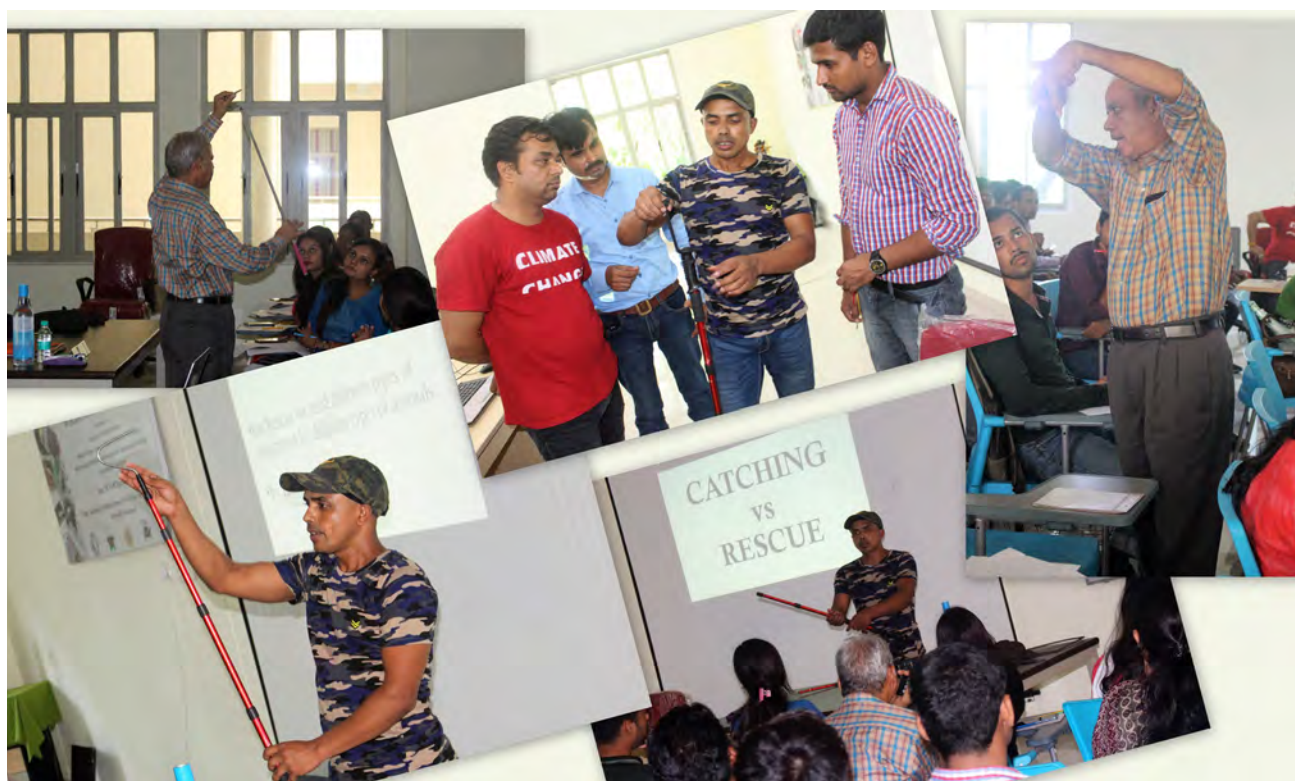
Snake experts demonstrating the participants that how to use the rescue instruments