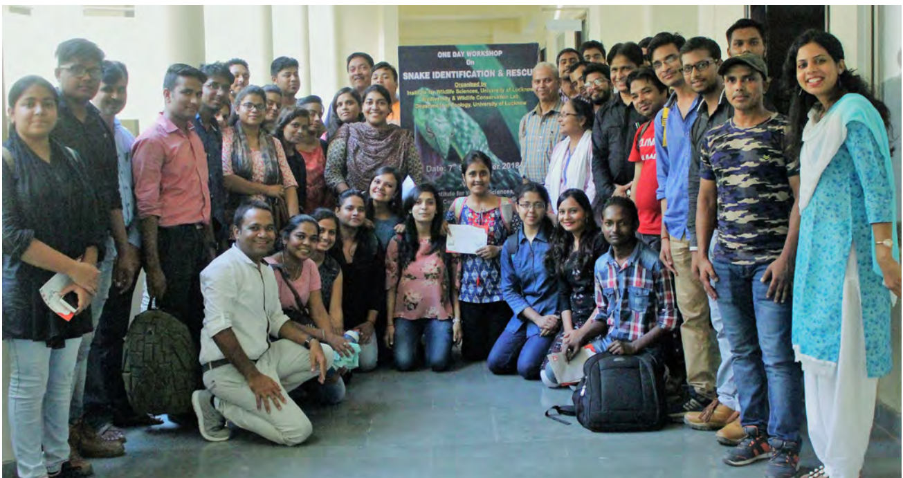
Participants of Snake identification and rescue workshop