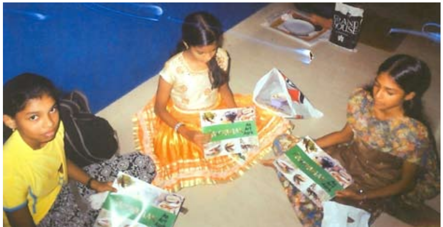
Students with amphibian colouring book got as a prize

in Calicut District opinioned the public. Another Leopard was killed in Idukki District between conflict with farmers and the animal said the participants.