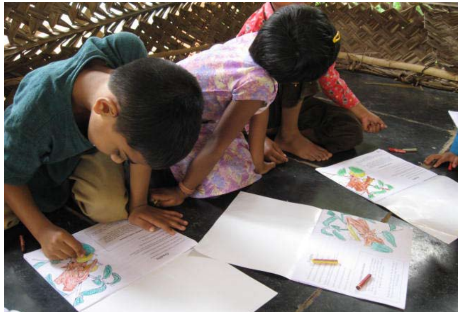
Children colouring the bats drawing