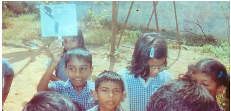
Children holding placard on stop dancing bear

On 20 th and 21 st the zoo organised programme on the conflict between wild animals & farmers etc. staying close to the Forest area. Recently in Wayanad a Elephant, Gaur, Leopard was killed and one Leopard