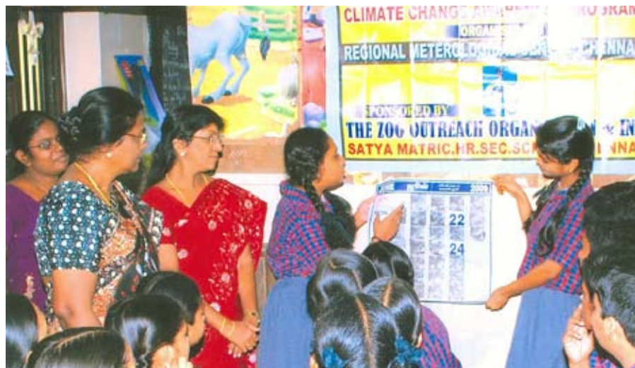
Students looking at weather chart - Meteorological station during field visit

Activity on Climatic Change: The students of Std IX were taken on a Field Trip to the Meteorological