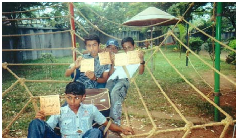
Children sitting on the model web reading Daily life wildlife packets

On the 15 th January the programme started along with the Solar Eclipse. The behaviour of the animals during the Eclipse timings was studied during the time. The change in character of butterfly