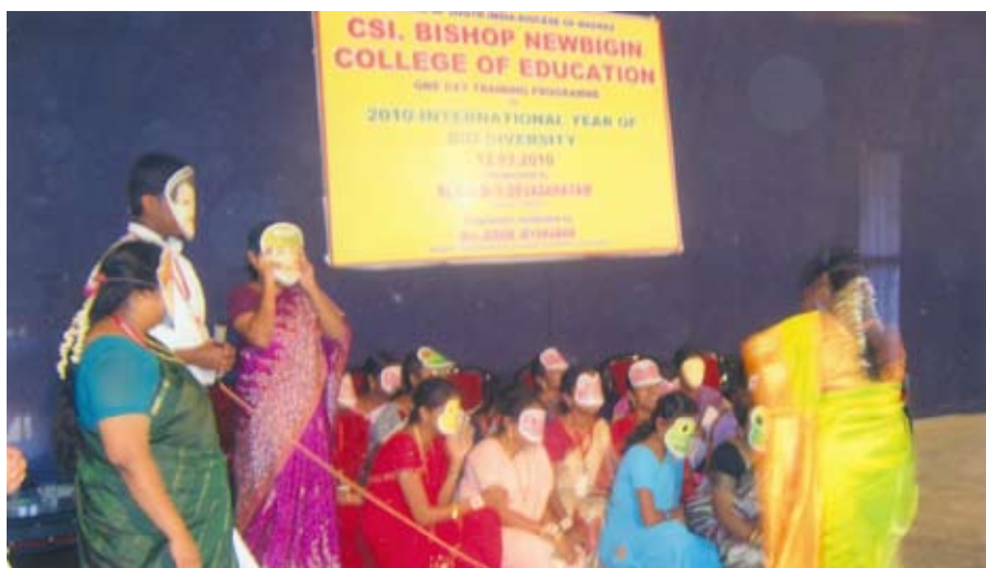
Performing role-play on amphibian conservation

Recent incidents about a spurt of elephants going on a rampage due to man encroaching into their land, depriving them of their food and habitat were discussed. A say "No" to ivory and other animal products