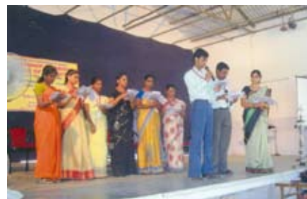
Reading out do's and donot's in HEC area from ele-kit packet