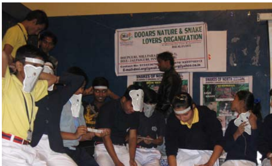
Students enjoying wearing ele-kit items

ratio, country liquors etc. were elaborately described. Through the enjoyable snack time(at about 4.40 p.m) we finished the first day workshop on HEC & HECx.