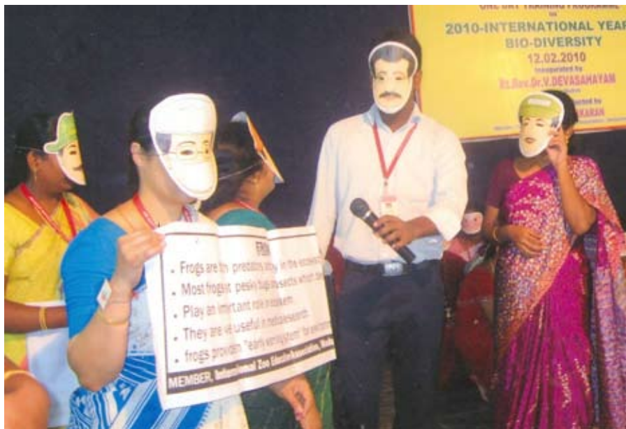
Teacher trainees showing a poster on importance of amphibians