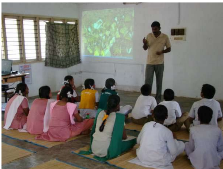
Students are introduced Animal Welfare by talk

On behalf of our environment education team and IZE, I would like to thank Zoo Outreach Organisation for supplying and coordinating the education packets to us. On this occasion, I would like to thank ZOO, WILD, Awley Wildlife and People Apenheul Primate Park, IZE, IUCN/SSC