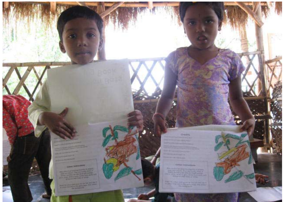
Children posing with coloured bat drawings