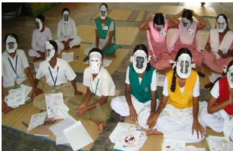
Session on "how captive animals are treated" special focus on monkeys