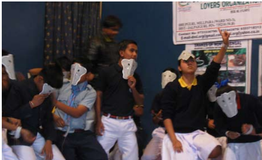
Students active interaction in the programme

The first topic of the first day was HEC, through the discussion of semi-elaborate story of elephant in our art, festival, cultures, mythology; we started our programme at about 10.45 a.m. We discussed the topic for 45 minutes. After that structure of Elephant were described (11.30 a.m to 12.30 p.m) such as their trunk, foot, tallest point, ears, skin, etc. Then the characteristic features were explained (12.30pm to 1.30 pm.) such as their food, life span, pregnancy, maturity, habitat, weight at the times of birth etc. In between the discussion, from 1.30 pm -2.10 pm. We took a lunch break. After the lunch break one of the important topics were described, that was "differences between Asian & African Elephants." The differences between their tallest points shape of the heads, ears, foot, skin, trunk, etc. were also explained. Next, we moved to HEC (2.50 pm -4.40 pm). The main causes behind the HEC, such as change of habitat, over grazing of domestic animals, over exposure of population near the forest area, abnormal sex