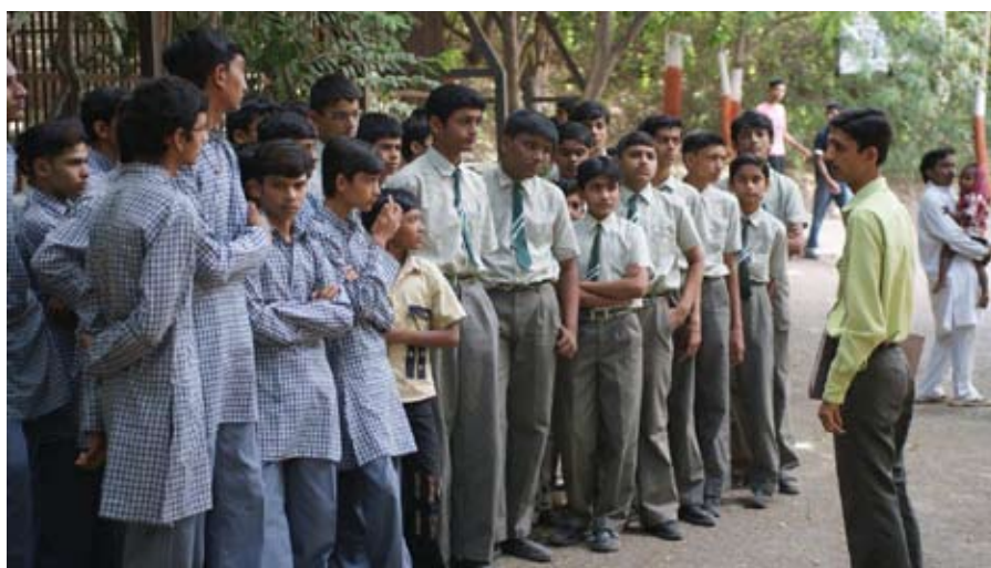
Children attending Nature Camp at Rajkot Zoo

Participating Schools were given following items in advance for celebrating the week. Literature set of wildlife, Birds, Pamphlets, posters etc. One canvas Sign Board for display in the entry gates every school. Achievement certificates. In addition to this trophies and caps were also given to the winners. The students who came to Nature Camp at Rajkot Zoo were