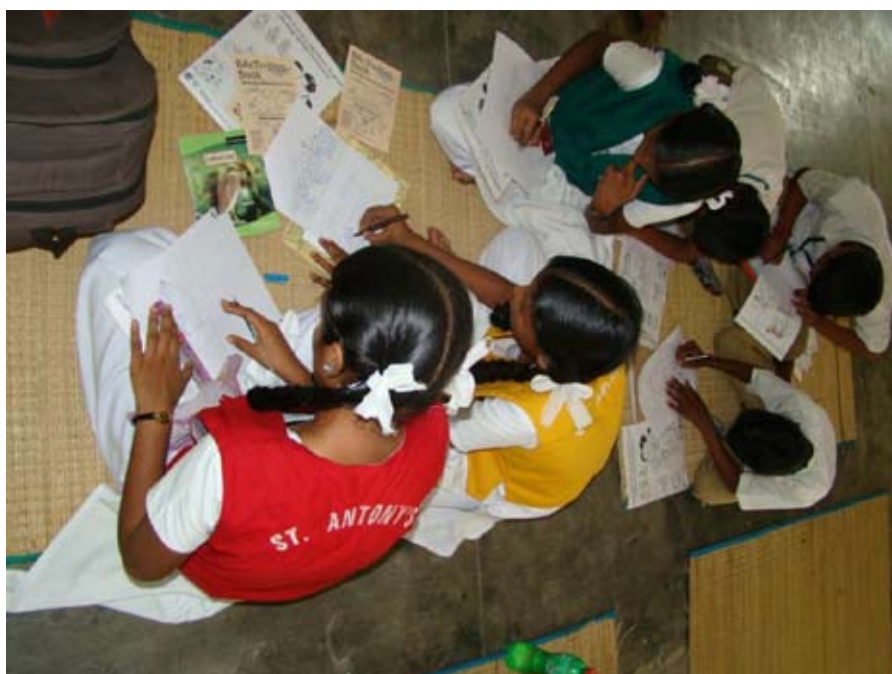
Sketching activity to highlight the "animal welfare and animal cruelty"