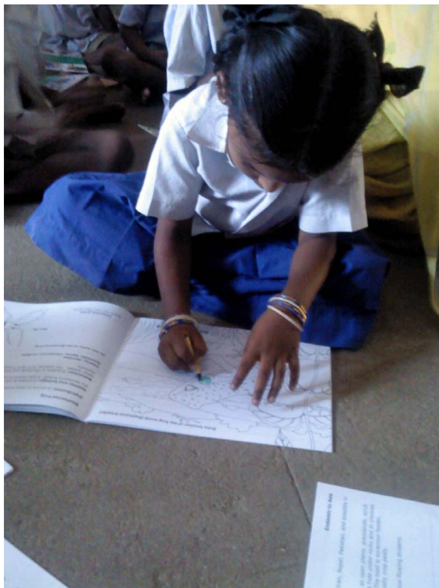
Child colouring the frog picture in the amphibian colouring book