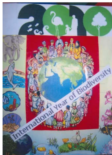
Poster developed on "International Year of Biodiversity"