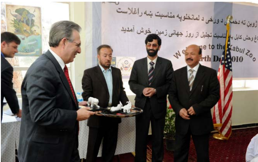
Special gifts to the guests: Sculpture of Afghan animals