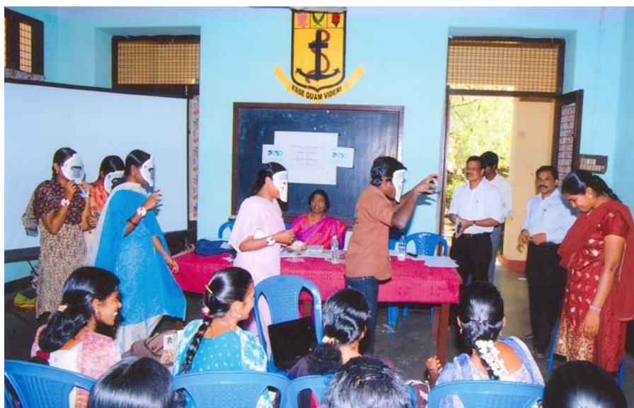
Mind your monkey manners: Do's and don'ts with problem monkeys