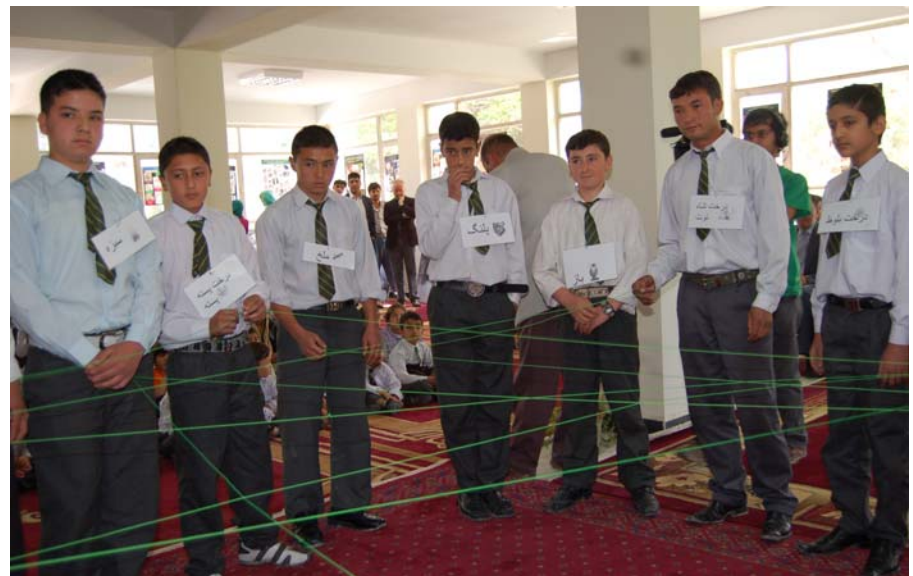
Students playing food web game