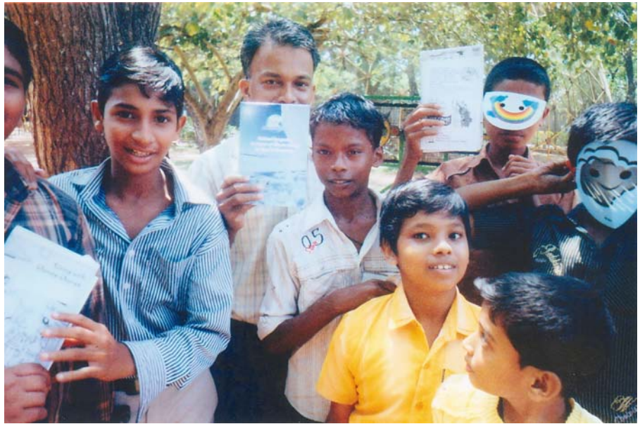
Children with ZOO's climate change education kits

However the sparrows found near the Mangalvanam Bird Sanctuary in Kochi would be threatened due to the construction work likely in the