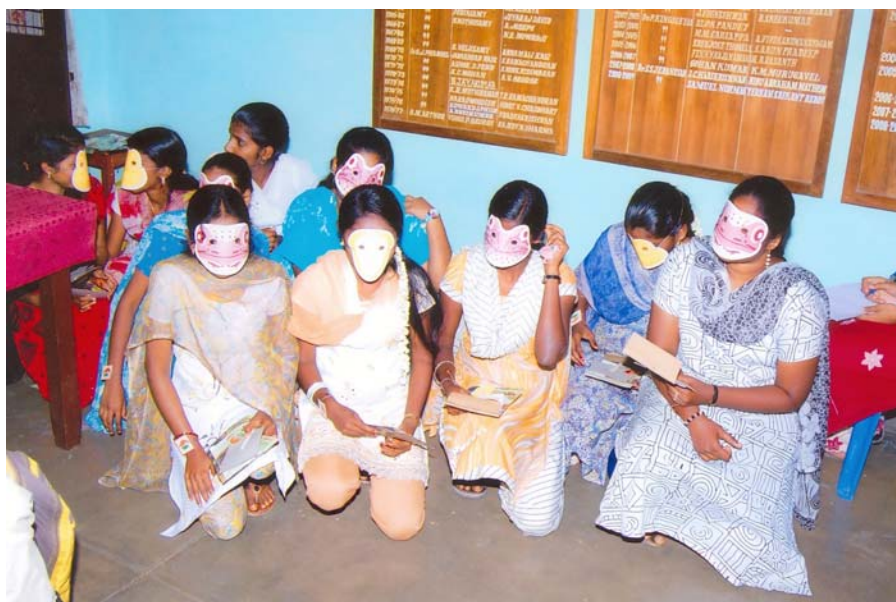
MCC students playing skit on amphibians