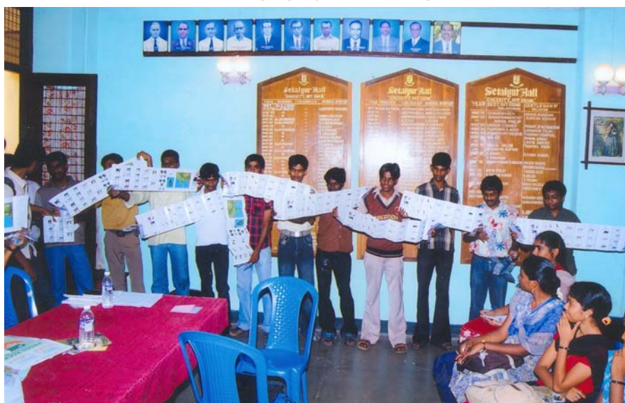
Students explains about kinds of South Asian Primates