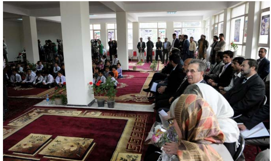
Students and guests at the Earth Day celebration