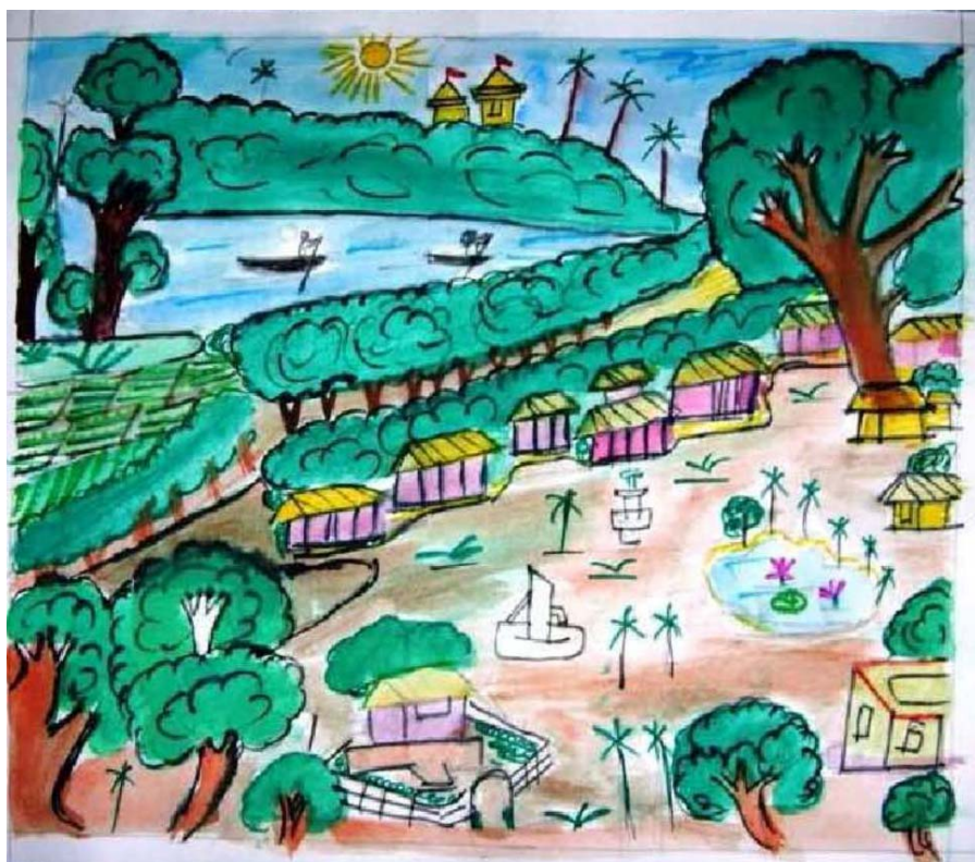
Beautiful drawings done by the students

Earth day is an annual observance held on April 22 every year to increase public awareness on the environment. Earth Day has been used as a powerful catalyst to involve community in making a difference towards a healthy, prosperous and sustainable future. We stand at a critical moment, a time when humankind must choose its future. While environmental degradation hurts us all, the consequences of fewer natural resources and increasing of climate change impacts strike animal biodiversity and poor people especially hard. As the society becomes increasingly