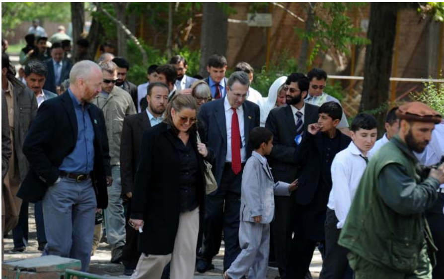
Guests and students touring around the zoo