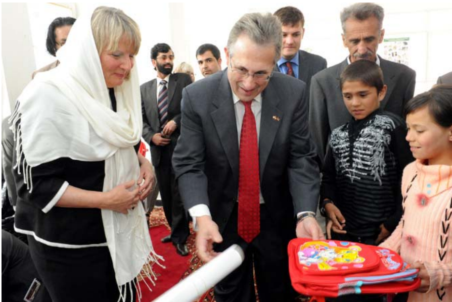
Students presented with gifts by US Ambassador and his wife