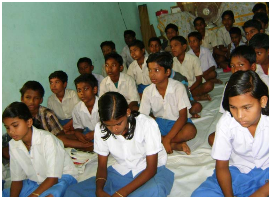
USAK High School students attends Earth Day celebration activities

Number of activities were also conducted to honour the beautiful planet 'Earth'. Some students made paper bags from old