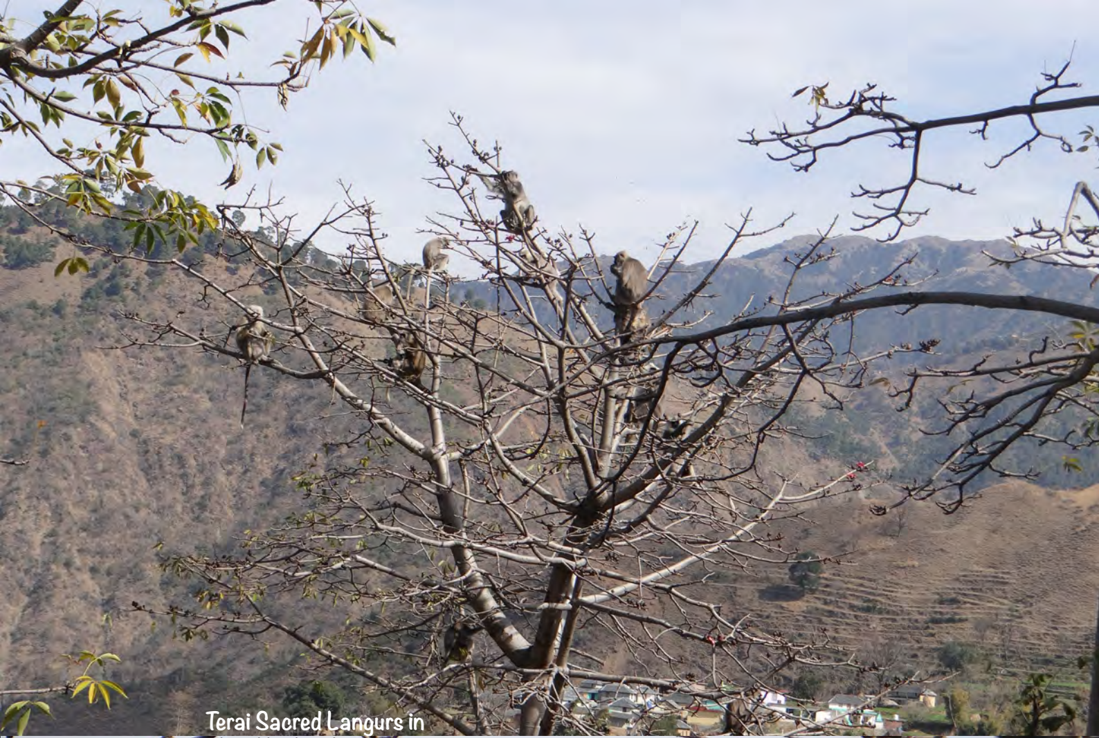
Terai Sacred Langurs in Shivalik Himalaya