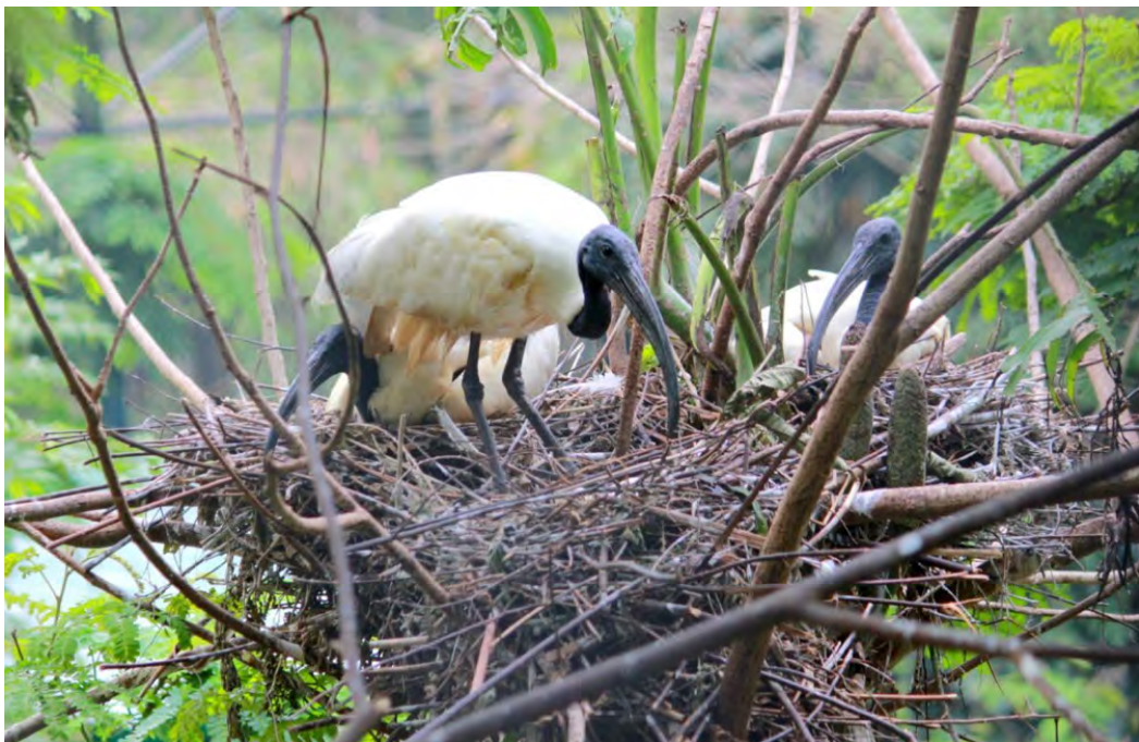
Black-headed Ibis during the incubation stage in Trivandrum Zoo.