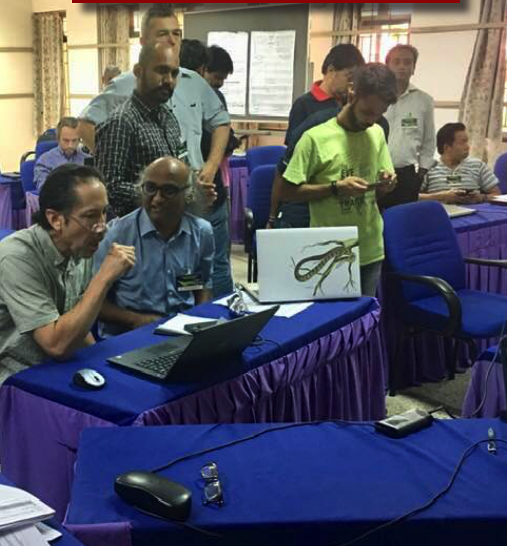
Initial thoughts and discussions on moving to the phase after status evaluation.

The Key Biodiversity Areas approach helps to identify and designate areas of international importance in terms of biodiversity conservation using globally standardised criteria. Identified KBAs — 45 threatened species prioritised.