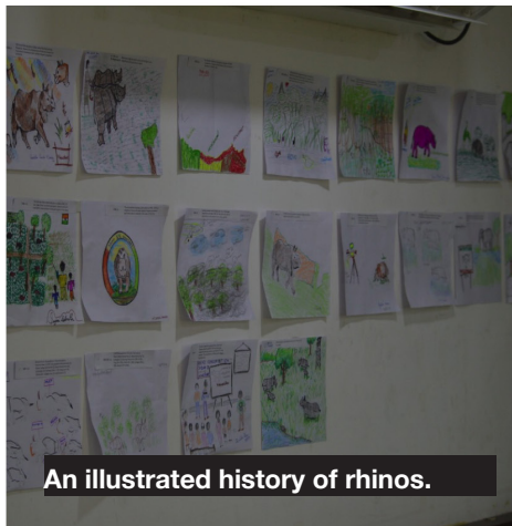
An illustrated history of rhinos.