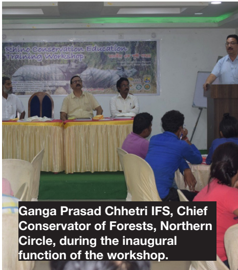
Ganga Prasad Chhetri IFS, Chief Conservator of Forests, Northern Circle, during the inaugural function of the workshop.