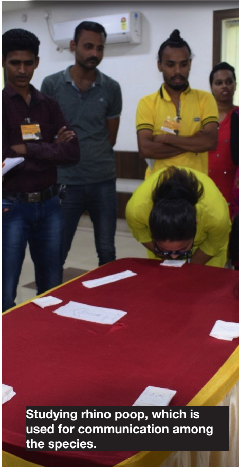
Studying rhino poop, which is used for communication among the species.