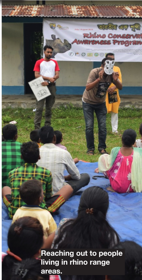
Reaching out to people living in rhino range areas.