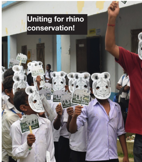
Uniting for rhino conservation!