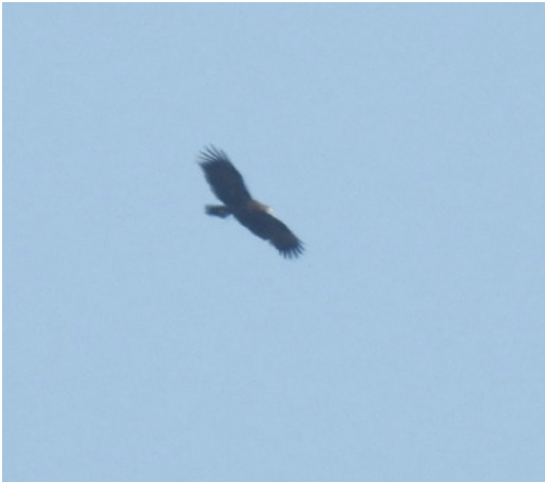
Greater Spotted Eagle Clanga clanga in Assam University, Silchar (Photo: M. Miraj Hussain).

Once grouped under genus Aquila , A. hastata and A. clanga have been placed under a new genus Clanga , and now they are known as Clanga hastata (Indian Spotted Eagle) and Clanga clanga (Greater Spotted Eagle) (Praveen et al. 2017; BirdLife International 2018). Both species are categorized as Vulnerable (Praveen et al. 2017).