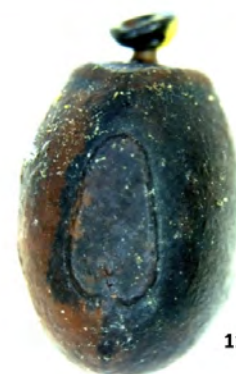
Image 9–11. 9— Phryganistria virgea (MNP, upper), P. virgea (Shillong, middle) and P. virgea (Yarkaud, lower) | 10—Poculum of P. virgea (MNP, upper), P. virgea (Nemotha, lower) | 11—Egg of P. virgea (Shillong).

femur 42, tibia 42, tarsi 17; in hindleg: femur 49, tibia 54, tarsi 22.