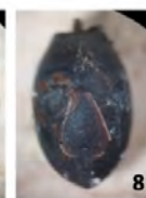
Image 1–8. Phryganistria virgea : 1—Female, entire | 2—Male, entire | 3—Supra anal plate of female | 4—Last abdominal segments of female | 5—Pre-opercular organ of female | 6–8—Egg of female.

antennae 45.0mm + (broken); prothorax 12, mesothorax 59, metathorax 27, median segment 13, rest of abdomen 145; in fore leg, femur 76, tibia 101, tarsi lost; in midleg, femur 54, tibia 62, tarsi 24; in hindleg, femur 62, tibia 78, tarsi lost; operculum 35.0 + (broken at tip).