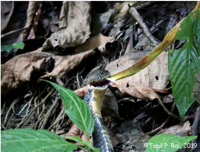
Ophiophagus hannah biting head of prey to swallow it.