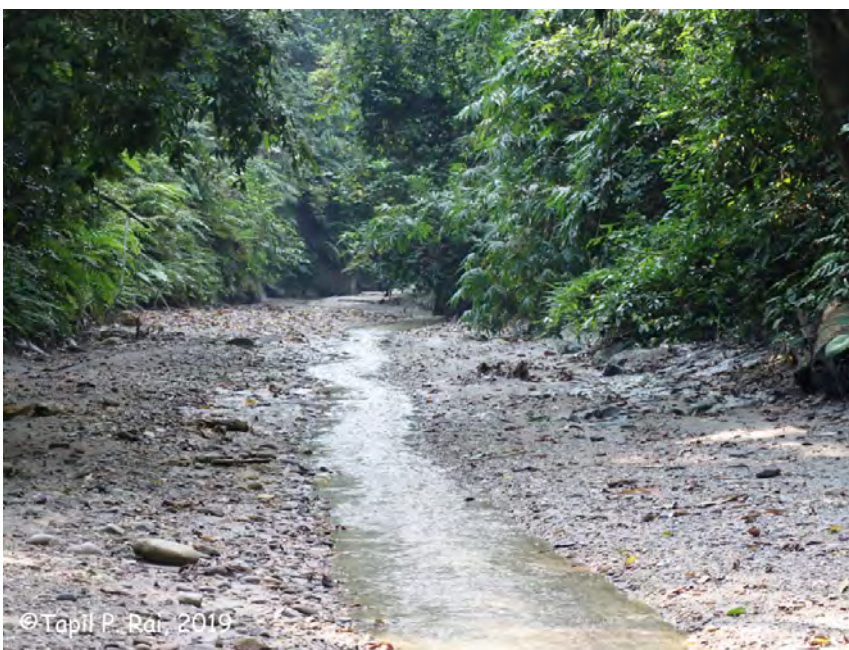
In situ habitat of Ophiophagus hannah .

The total body length of Boiga ochracea is measured 92cm with snout vent length of 84cm, and tail length of 8cm.