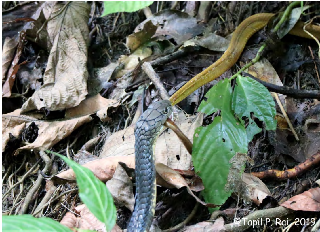
Envenomation by Ophiophagus hannah .

Ophiophagus hannah (Cantor, 1836), commonly known as King cobra or Hamadryad, is the world's largest venomous snake that belongs to the family Elapidae. Its body is fairly stout in adults, slender in juveniles and the flat head is distinct from neck; which is capable of dilating into an elongated hood (Schleich & Kästle 2002; Pandey 2015; Das & Das 2017). King Cobra has a large pair of occipital scales in contrast to common cobras. The dorsal colour is variable: dark brown, olive-brown or grey-black, with pale yellow or orange bands in young that may or may not persist in adults