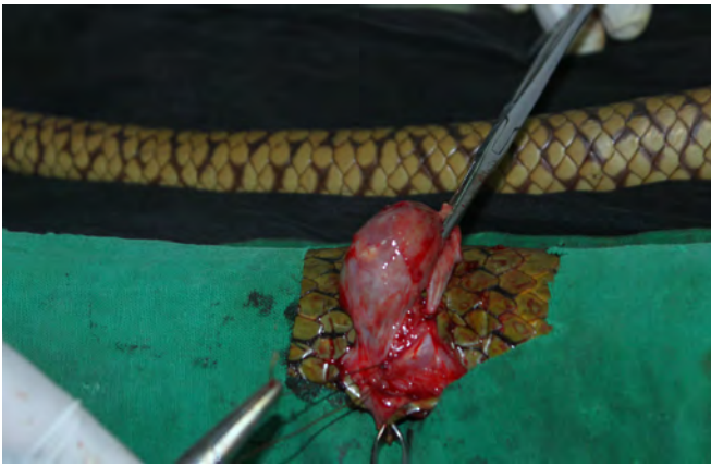
Fig 3. Abscess which usually appeared as capsule being removed as single mass altogether including abscess capsule.

carried out using restraint tubes. Snake hooks were kept handy and used when ever needed. Abscesses when palpated appeared as hard and localized swellings, some with a central scar and some without any openings (Fig 1). No heat or erythema was observed in the region as in mammals. Fine needle aspiration with a sterile 24 G needle yielded no exudates.