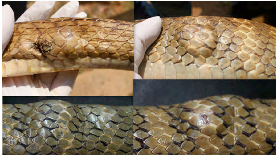
Fig 1. Appearance of abscess in Indian rat snakes, some with a central scar and some without any openings.

Indian rat snake is a colubrid found throughout south and south East Asia, from sea level to 4,000m (13,120ft). It is one of the most common snakes found throughout the country (Whitaker and Captain, 2004). Abscesses are one of the most frequent clinical entities of the captive snakes (Hoppmann and Barron, 2006). It is a localized collection of purulent material in a confined cavity formed by disintegration of tissue. Often, abscesses are triggered by traumatic injury, bite wounds, or poor environmental conditions (Klingenberg, 2011). Such abscesses were surgically managed using Isoflurane as inhalant anesthetics. Inhalation agents are commonly used for chemical restraint of reptiles (Read, 2004). As in other species, the advantages of inhalation anesthetics include superior control of depth, wide margin of safety, excellent muscle relaxation, fast recovery, and "built in" oxygen supplementation. The present communication reports protocols followed during the surgical procedure and subsequent findings.