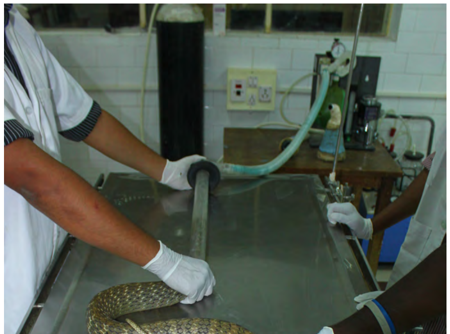
Fig 2: The snake restrained in restraining tubes and the opposite end of the restraining tube connected to the anesthetic circuit.