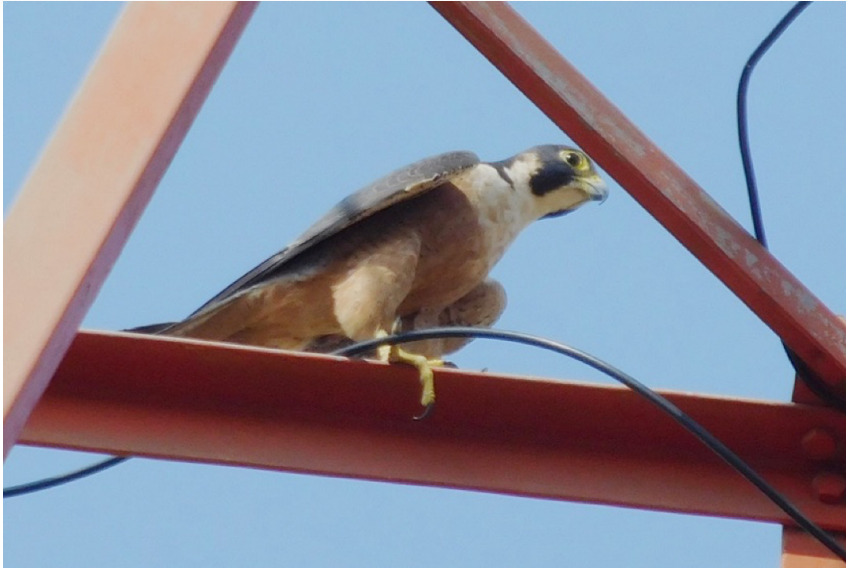
Shaheen Falcon sighted in Joranda, Similipal Tiger Reserve, Baripada, 01.xi.2017.

complete black face mask is sharply demarcated from the white throat. The length of the bird ranged from 380 to 440 mm (Dottlinger 2002; de Silva et al. 2007). There is no record of the Shaheen Falcon documented from Odisha before. Shaheen Falcons were frequently reported from Bangiriposi, Rairangpur Forest Division and Gupteswar, Koraput Forest Division, Odisha (Table 1). The high cliffs and rocky mountains of Similipal is one of the best habitats for this raptor. Looking at the rarity of Shaheen Falcon, our information is valuable for protection and conservation of this species.