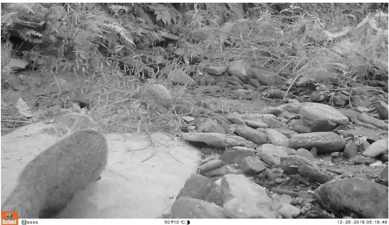
Image 2. Camera trap photograph of Crab-eating Mongoose from Bhimsen Thapa Rural Municipality, Nepal.

feeding on the crabs, frogs and small fishes as also described by (Chuang & Lee 1997; Thapa, 2013). Jnawali et al. (2011) suggested wider occurrence of species range in the country. In light of these, our record corroborates the verifiable evidences from Gorkha and Kaski districts of Nepal. Species spatial and temporal distribution information, generated nationally at large scale is deemed necessary for fabrication of conservation management plan. Rigorous camera trapping survey and specific species focused