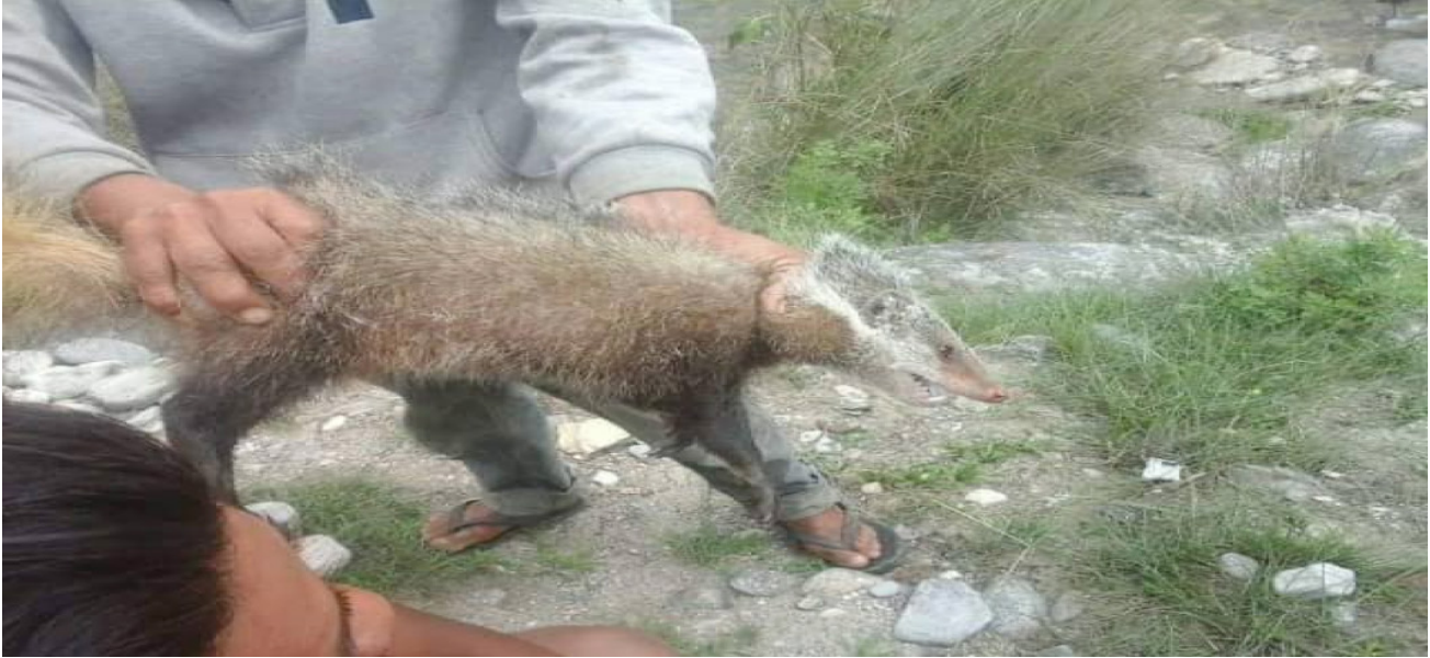
Image 1. Dead Crab-eating Mongoose Herpestes urva from Barpak, Gorkha.

On 12 June, 2018, a single Crab-eating Mongoose Herpestes urva was found dead due to unknown cause in Dhodeni Village ward number 4, Azirkot Rural Municipality, Gorkha District. Six months later two individuals were photographed by camera traps at two different stations (in Kalimati and Mahadevtaar villages, Bhimsen Thapa Rural Municipality, Gorkha District). The species was camera trapped at an elevation of 607m in close proximity of the settlement around 1km where human intrusions and grazing were excessive. On 21 March 2020, we photographed a single Crab-eating Mongoose from Rupa Lake, Kaski District in marshy agricultural field (Fig.1). The species was recorded at 15.51h with a total of three photographs taken from Coolpix Nikon