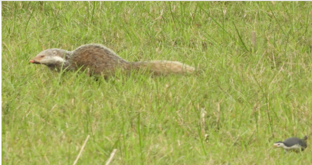
Image 3. Crab-eating Mongoose in marshy agricultural landscape from Rupa Lake, Kaski District.

direct and indirect survey should be done outside the protected areas system to exaggerate the concrete data on the ecology and threats being faced.