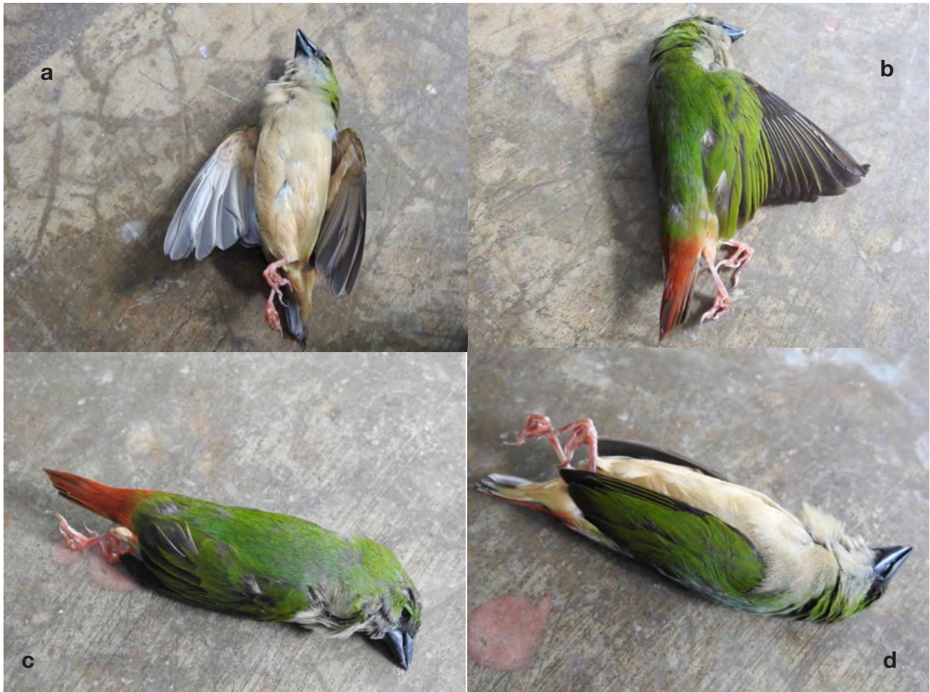
Image 1. Ventral (a & d) | dorsal view (b & c) of PP species sighted from Alley under PWS, Bhutan.

The Pin-tailed Parrotfinch Erythrura prasina Sparrman, 1788 is newly recorded from Alley in Nichula under Phibsoo Wildlife Sanctuary (PWS). With this record, Bhutan now has 745 bird species out of 770 bird species predicted to occur in Bhutan Himalaya. These findings recommend separate study to double check the live presence within previous sighted locality and requires comprehensive morphometric measurements