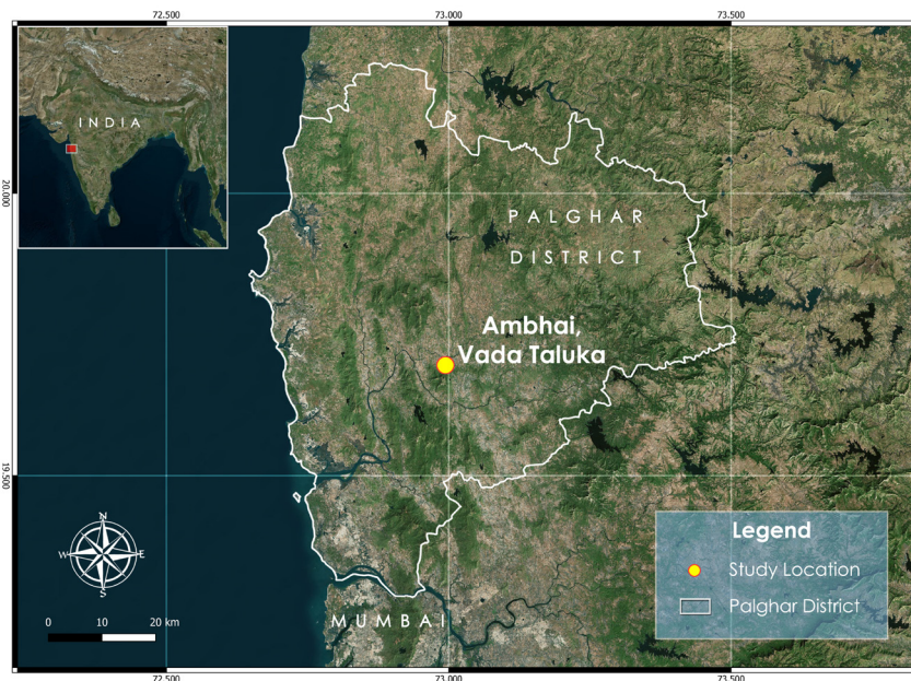
Figure 1. Satellite map of Palghar District showing Ambhai Village, Vada Taluka, locality of Epophthalmia frontalis (Map is created in QGIS 3.10.2, ©Dattaprasad Sawant).

Tamil Nadu) and eastern India (Assam, Meghalaya, Odisha) (Lieftinck 1931; Mitra 2002; Subramanian et al. 2018). According to Fraser (1936), E. frontalis of eastern India is E. frontalis frontalis and that from the Western Ghats is E. frontalis binocellata . E. frontalis could be easily overlooked by many researchers due to its close resemblance with the congeneric and more widespread species, E. vittata . In this paper, we report the northernmost distributional record of E. frontalis from Ambhai Village, Vada Taluka,