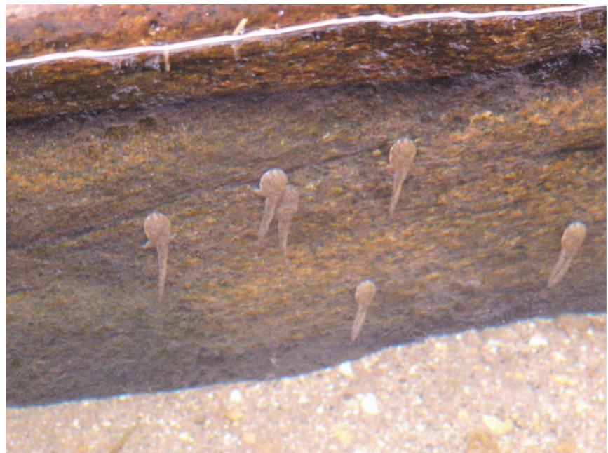
Tadpoles of Nasikabatrachus cf. bhupathi in Kannakkarai Falls, Agamalai, Theni.