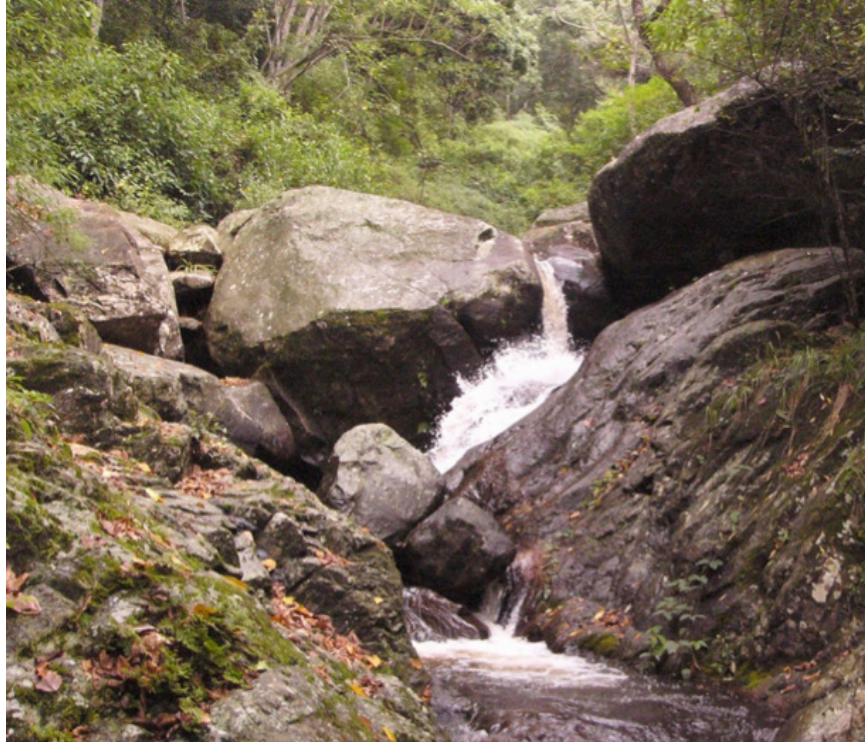
View of Kannakkarai Falls, Agamalai, Theni.

During the bird watching trip on 7 October 2012, I sighted six tadpoles of Nasikabatrachus cf. bhupathi attached to rocks of fast flowing stream in the Kannakkarai Falls (10.131254N, 77.437499E, 550 m), Agamalai Hills, Theni, Tamil Nadu, India. The surrounding habitat is riparian forest with private estates. The currently reported location is in the eastern