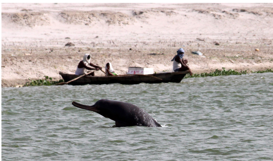
The long-term survival of the Ganges River Dolphins depends on the symbiosis of the species with the fisher community, hence it needs to be conserved and promoted in post anthropause world.