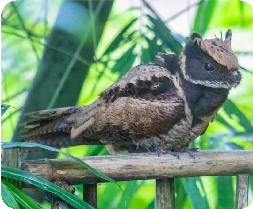
Great Eared-Nightjar in Lankadweep Village of Kakoather.

Sighting 3 – We observed it only during the day, perched on a bamboo fence 1.5 m high approximately. It went off at dusk and returned at dawn. We were unable to track it at night.