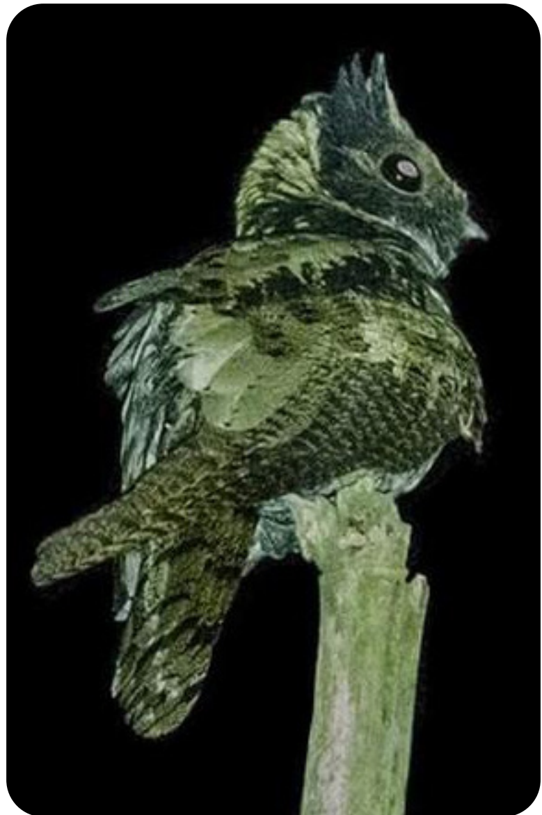
Great Eared-Nightjar in Maguri-Matapung Beel in Natungaon area.

Sighting 2 – The call was very prominent here. It used to call each time it returned to its perch. The feeding pattern was exactly the same as the previous one. It sat on a bamboo pole at 5–6 m high approximately. We observed 2–4 cycles in the evening before it flew off.