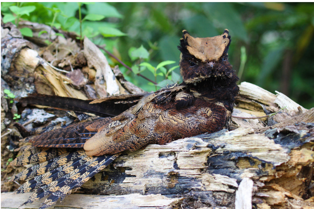
Great Eared-Nightjar in the garden of Guijan area.

Sighting 1 – Daytime, sat on a fallen tree about one metre from the ground, sleeping