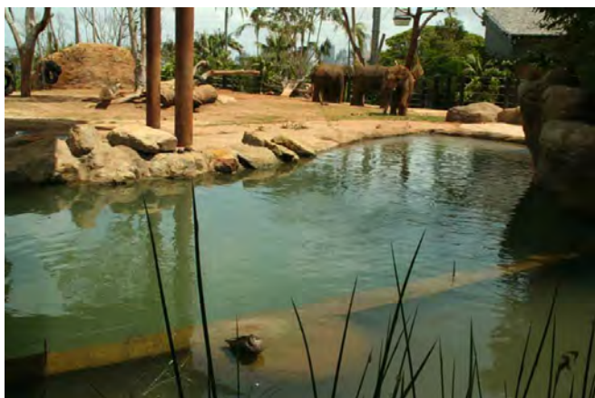
Pool: A water pool in which the elephants bathe, play and drink

Taronga's group of elephants inhabits an exhibit surrounded by a simulated river with places for them to swim and frolic. This feature is 60m long, 3m or more wide and 3m deep, with shallow areas at both ends and in the middle for elephant access. Because Taronga is an urban zoo with limited space, the river feature was incorporated to facilitate aquatic aerobic exercise for the elephants to increase cardiovascular fitness with non-weight bearing exercise. It is well