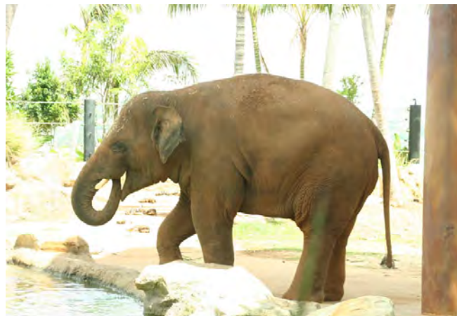
Elephant Drinking: An elephant takes a drink at the pool

The largest exhibit complex of Wild Asia is dedicated to Asian elephants. A single storey barn structure with 3 holding pens, elephant restraint device, keeper equipment store, food preparation and storage. The elephants are seen from the village as working