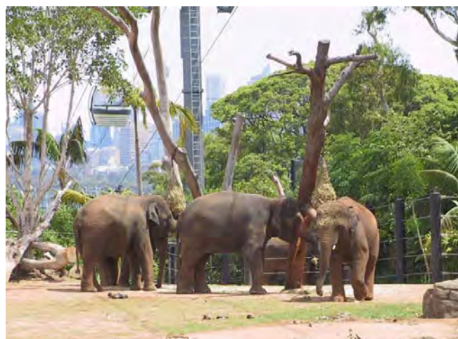
Trees: Wooden logs, poles and tree stumps provide surfaces for the elephants to rub their tusks on and for keepers to hang hay nets on