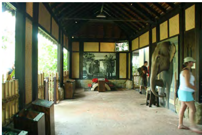
Elephant Exhibition Hall: An exhibition hall with display cases and interactive features for the visitors

The elephants' bath-time is a popular attraction for the visitors and provides an opportunity for the keepers to educate about these animals. This presentation details the use of elephants over many centuries, what they are used for today as well as the dangers and threats to the species' future survival.