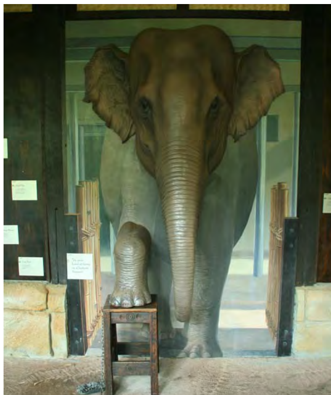
Interactive Elephant: This elephant creates a photographic opportunity for visitors who can pretend to be filing its toenails!

Especially for visitors, the barn features a behind-the-scenes area to view the elephants' facilities, learn more about how zoos care for them and get an insight into the real issues affecting elephants today.