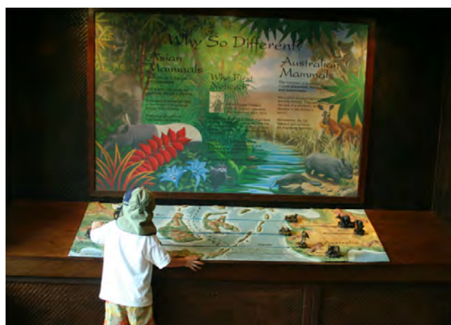
Interactive Display: This display is to educate visitors about the difference between Asian and Australian animals, and why they were separated by continental drift ©Monika Fiby, 2007