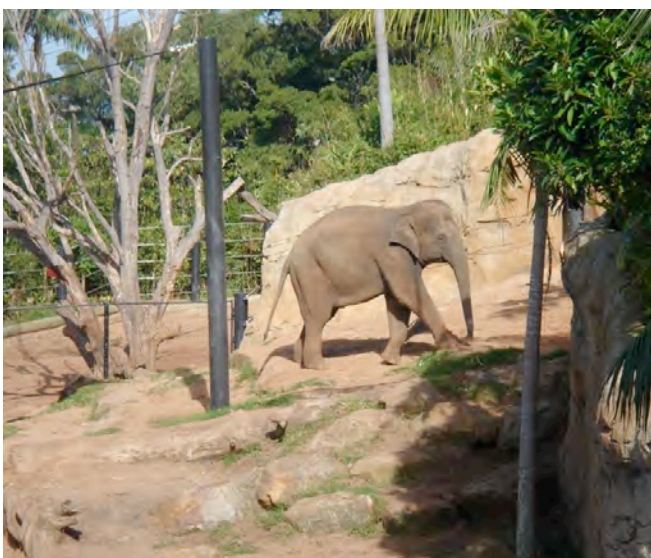
Elephant Steps: The lower exhibit area is connected to the upper area with broad boulders forming elephant steps, planning that the elephants would be lead on circuits including swimming and hill climbing as a diverse exercise program ©Jon Coe, 2007