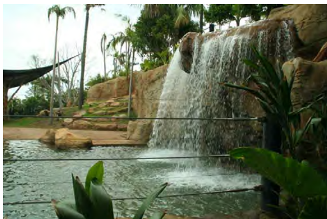
Waterfall: Lower elephant exhibit area with pool and waterfall for elephant enrichment. Note steep bank elephants traverse between lower and upper display areas, encouraging exercise and physical fitness