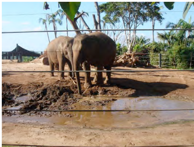
Enrichment: Mud wallows can stimulate play behavior in elephants ©Jon Coe, 2007