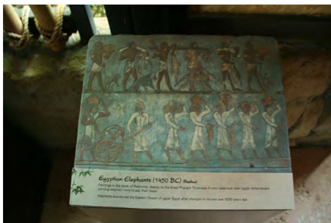
Egyptian Elephants: A plaque of an old painting, showing the Egyptians carrying elephant ivory tusks

These programs are endorsed by the Australian Government as 'Cooperative Conservation Programs' (CCPs) with agreed principles, and implementation of international treaties including the Convention for International Trade of Endangered Species (CITES).