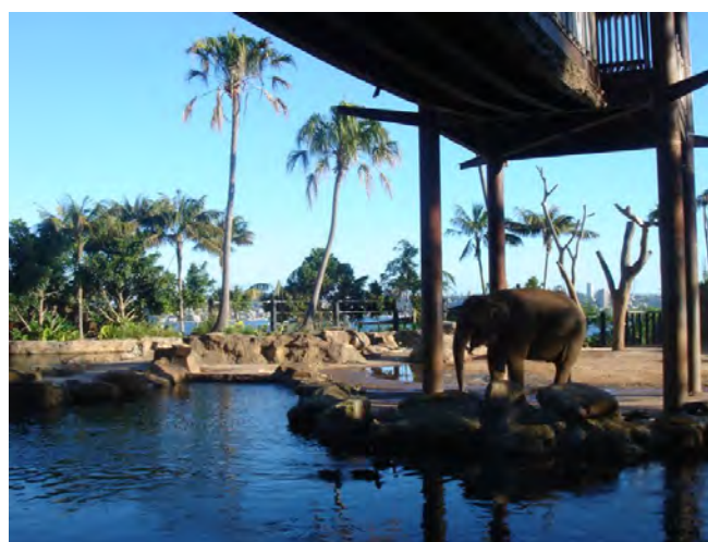
Shade for elephants: Elephant under shelter of VIP "stilt house" viewing structure simulating flood plain buildings and provide shade for elephants near the public ©Jon Coe, 2015