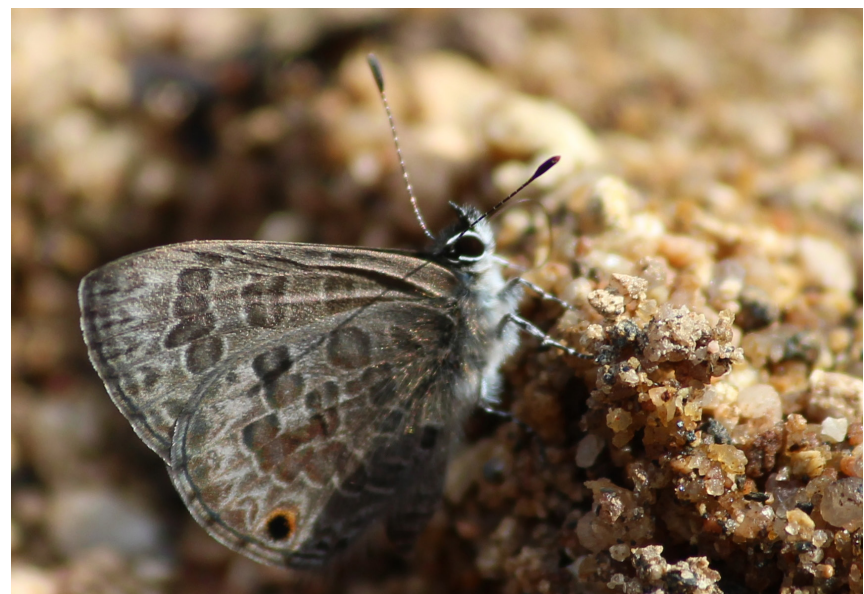
Prosotas noreia . ©Gulab Chand.