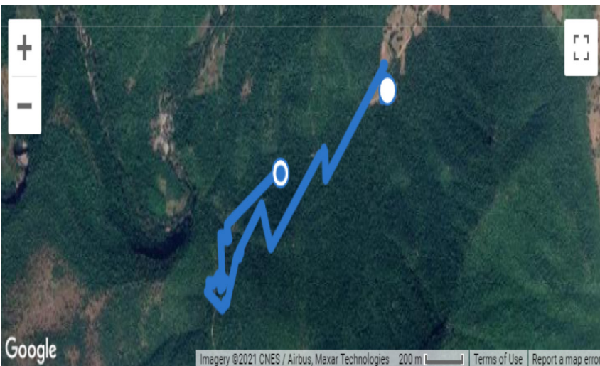
Track of butterfly walk on 28 November 2021.