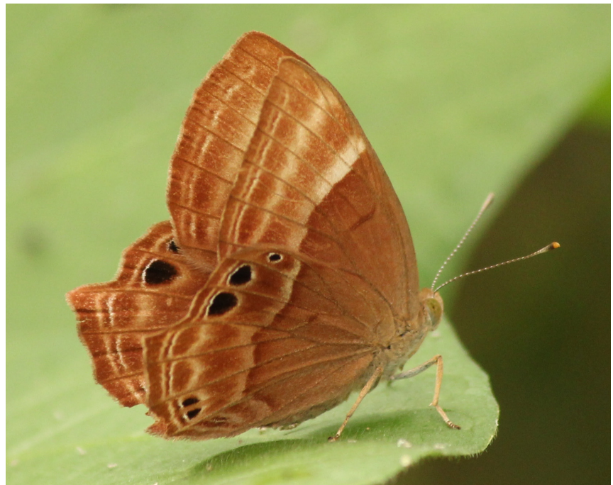
Abisara bifasciata.

Our survey area was restricted to the Rishijharan Waterfall (19.7798 & 82.5837), which is located in the Deobhog block of Gariaband District in the vicinity of Udanti-Sitanadi Tiger Reserve in Chhattisgarh, India. Rishijharan Waterfall is a small seasonal waterfall where the water flows in full force during the rainy season only, whereas a trickle of water continues throughout the year