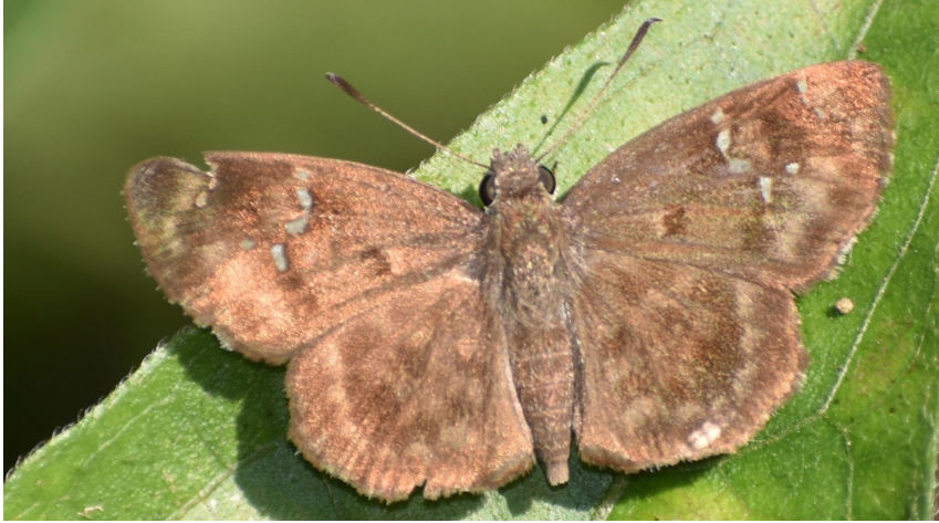
Sarangesa dasahara.

Newsletter of the Invertebrate Conservation & Information Network of South Asia (ICINSA)