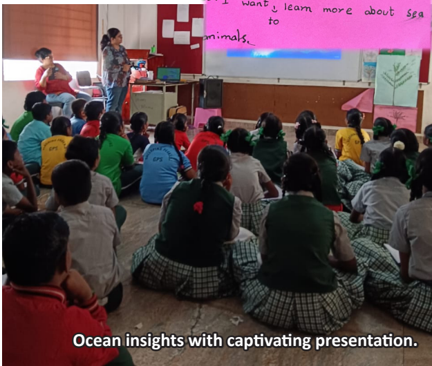
Ocean insights with captivating presentation.

as I want to learn more about sea animals to