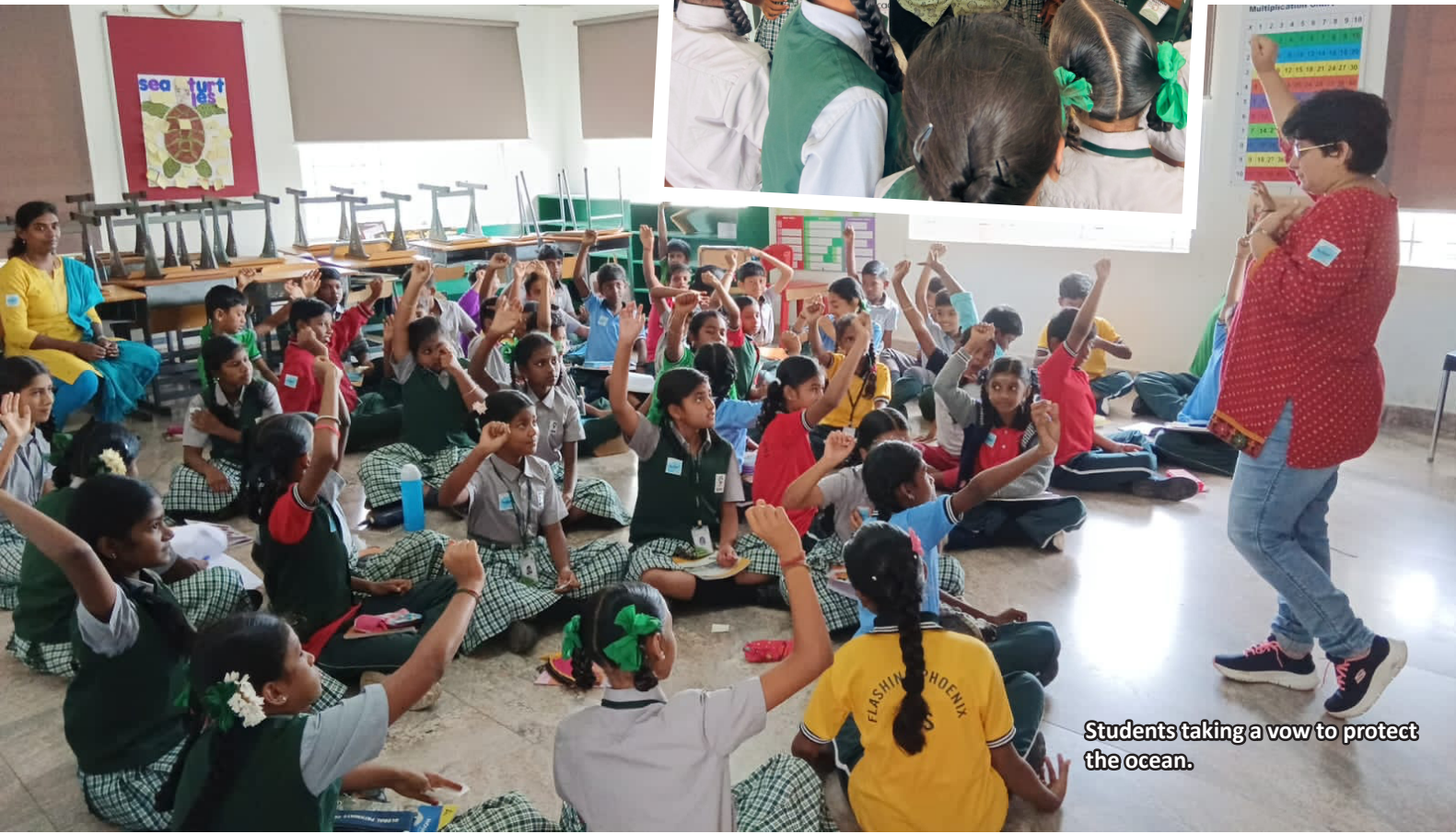
Students taking a vow to protect the ocean.