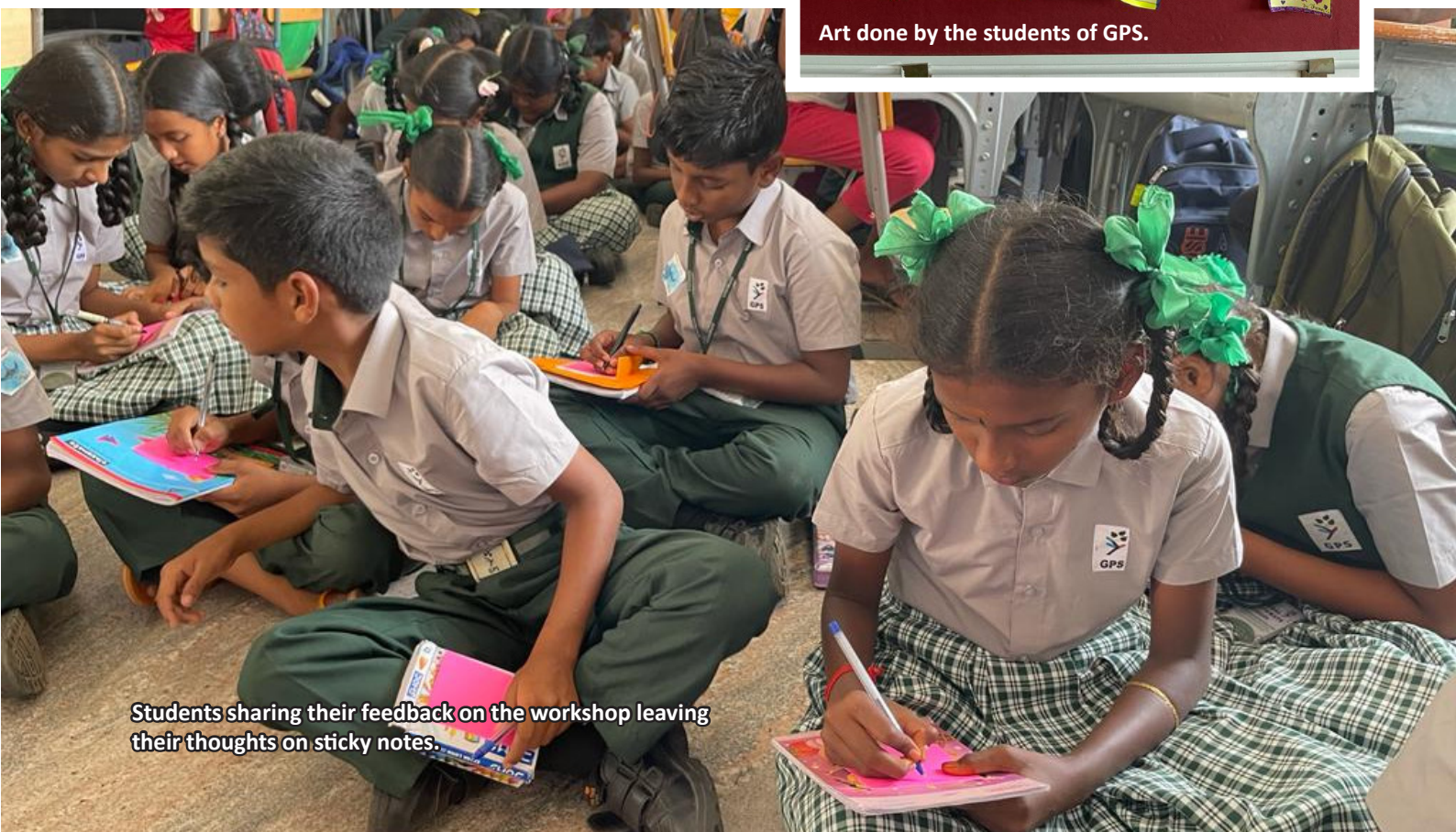
Students sharing their feedback on the workshop leaving their thoughts on sticky notes.