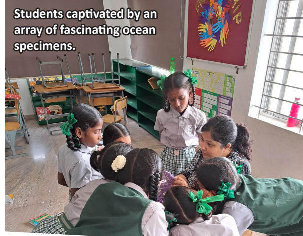
Students captivated by an array of fascinating ocean specimens.