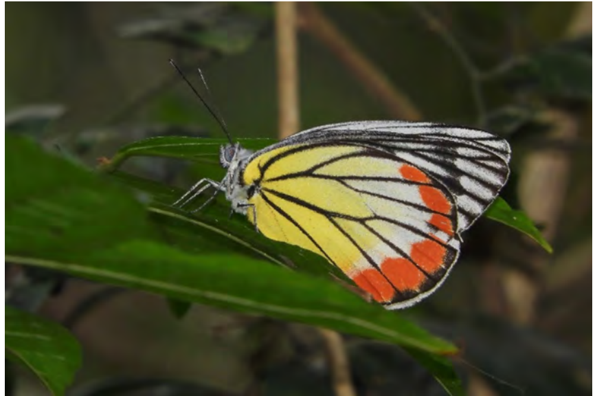
Painted Jezebel Delias hyparete from Rukminipur village of Purba Medinipur district, West Bengal.

On 23 April 2020, while we were roaming around in search of birds and other wildlife in the small forest patch (21.9005 N, 87.5380 E) inside Rukminipur village of Egra-II block, Purba Medinipur, West Bengal, we saw this beautiful butterfly flying lazily and sat on a leaf. We took a few