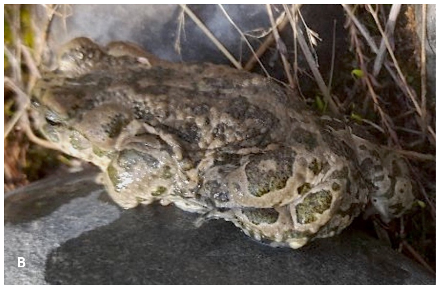
The Ladakh Toad Bufo latastii dorsal (A) and lateral (B).

Asian toads in the Trans-Himalayan region have developed distinctive coping mechanisms to endure the harsh winter climates within their habitat, such as