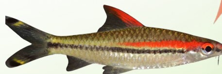
Denison Barb Fish

I don't belong to a bowl. Stop using me as a showpiece.