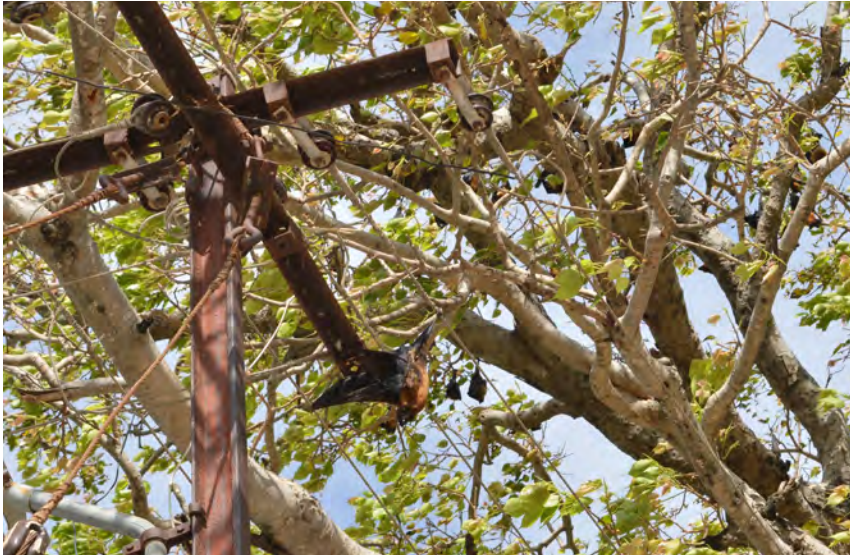
Electrocuted Indian Flying Fox Pteropus medius at Tiruchendur roost site.

(Thoothukudi District, Tamil Nadu, India) between August 2015 and November 2017. I recorded this electrocution of P. medius individuals within the day roost site and foraging sites up to 7 km distance from their roost trees. A total of 18 electrocuted P. medius individuals were observed, among these 16 individuals were observed in foraging sites, i.e., closer to fruit trees and the remaining two individuals were observed below the roost tree, where the power line passes. Mostly, young ones were made accidents on power lines during flight trials in their foraging area. Among these female bats ( n = 11 ) were affected more compared to