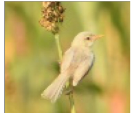
Albinistic Plain Prinia observed in Sathyamangalam.

Sathyamangalam (11.5235 N, 77.2451 E, 239 m). A small passerine bird was spotted with a white morph in the whole body, feathers and tail in the group. It is not common, and we closely observed the bird and found that it was an albinistic Plain Prinia. It was a chick that was fed by its parents. The Plain Prinia usually has a black bill, grey-brown upperparts, and whitish underparts (Grimmett et al. 2011). However, in this observation, the bird is fully white and has yellowish beak.