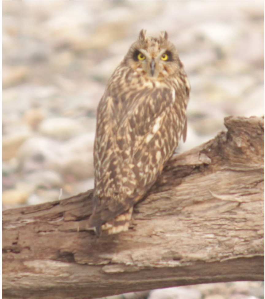
Short-eared Owl in RNP.

On 30 January 2024, at 1215 h while surveying in Raimona National Park (RNP) on the dry riverbed of the Hel River in Bamba Forest Block (i.e., Athiabari Range), which comprises of patchy grasslands interspersed within the dry riverbed. We inadvertently flushed out a Short-eared Owl (26.706 N, 90.181 E) which had been probably resting. The bird took a 15 m brief flight,