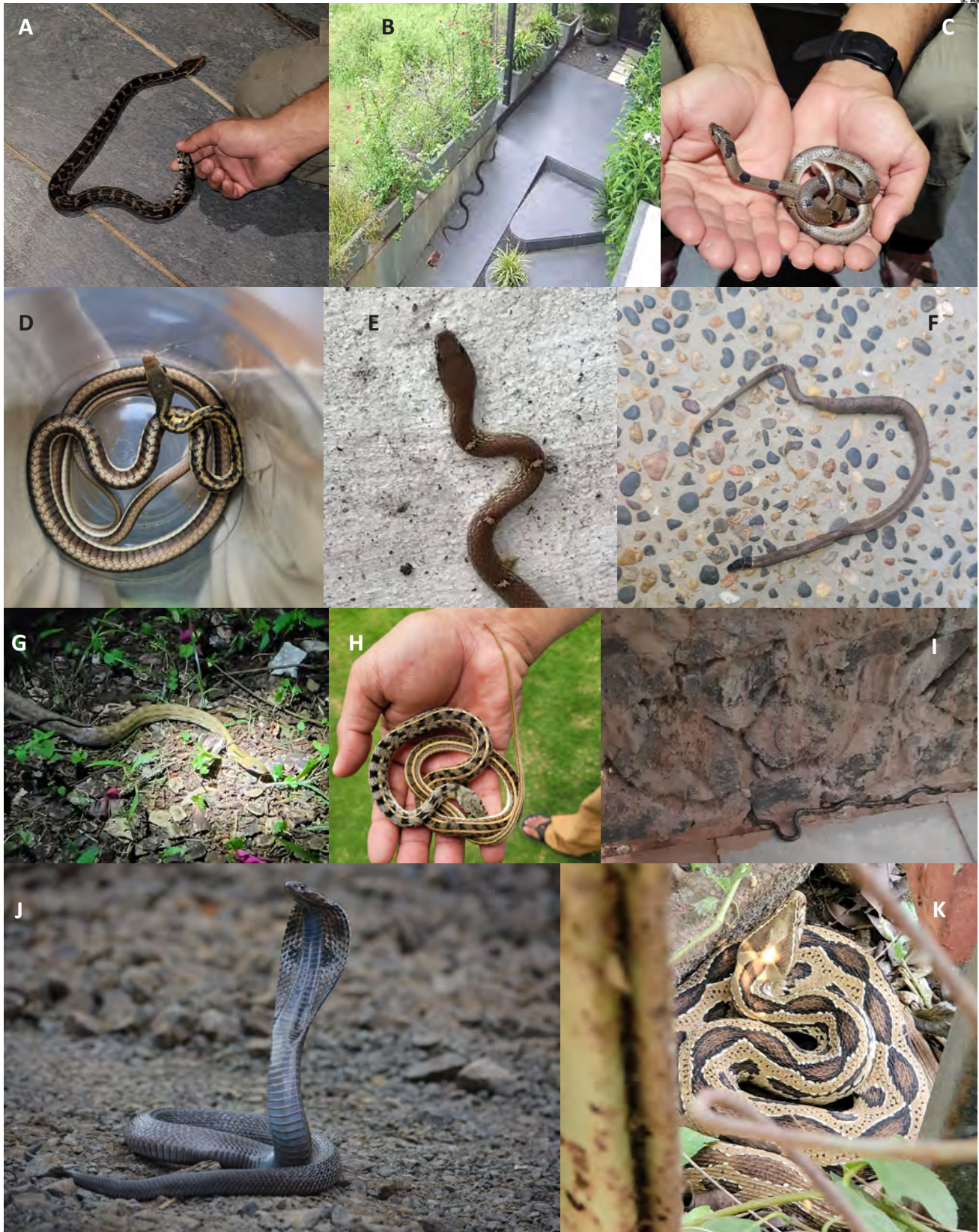
Snake species observed in the study area: A— Python molurus | B— Ptyas mucosa | C— Oligodon arnensis | D— Dendrelaphis tristis | E— Lycodon aulicus | F— Sibynophis subpunctatus | G— Coelognathus helenae | H— Amphiesma stolatum | I— Bungarus caeruleus | J— Naja naja | K— Daboia russelii.