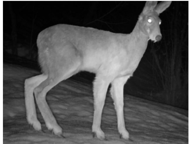
Himalayan Musk Deer.

It’s the only protected region with the highest diversity of Rhododendron species in the Bhutan. The study was conducted from the broadleaved plants with bigger leaves to alpine zone where plants have spiny like leaves, less vegetation, high altitude and cooler temperature with the altitude ranging from 1,584 m to 4,488 m. In the area of 10 sq m two camera traps were placed and the total area