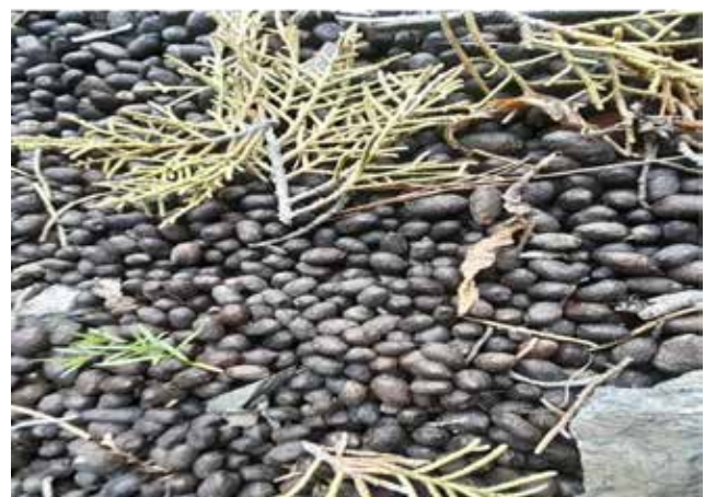
Pellets of musk deer.