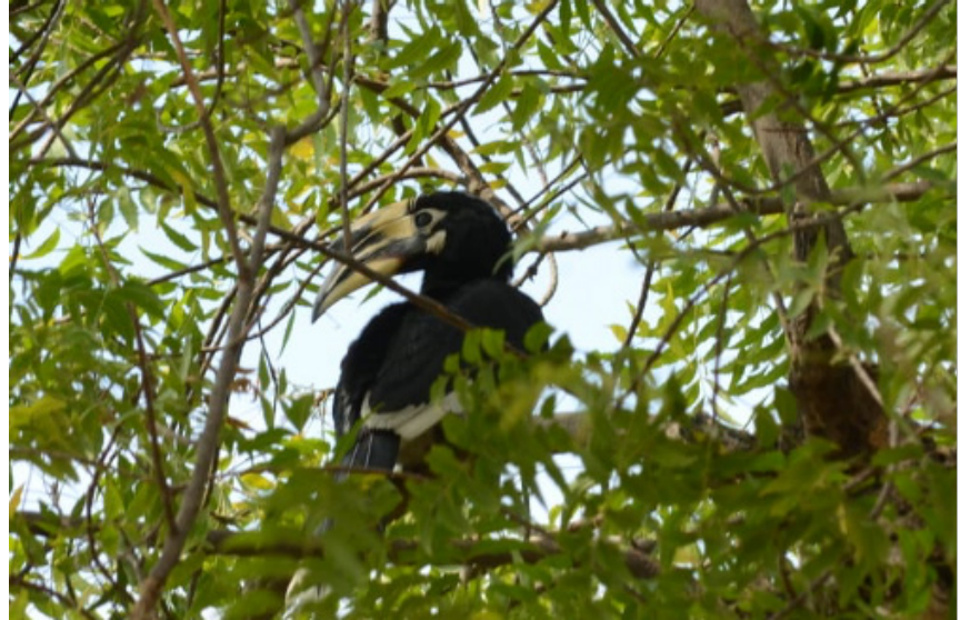
Oriental Pied-Hornbill roosting in Thar Desert, Rajasthan.

The sighting was recorded during a field survey conducted on 8 March 2023 in the eastern arid region of Thar Desert in Didwana-Kuchaman District of Rajasthan, India. The presence of the Oriental Pied-Hornbill was documented through direct visual encounter