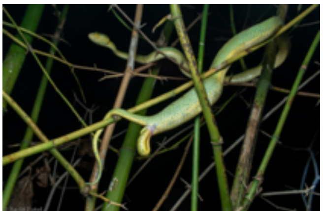
Observation of Bamboo Pit Viper Carspedocephalus gramineus giving birth in the Wild.