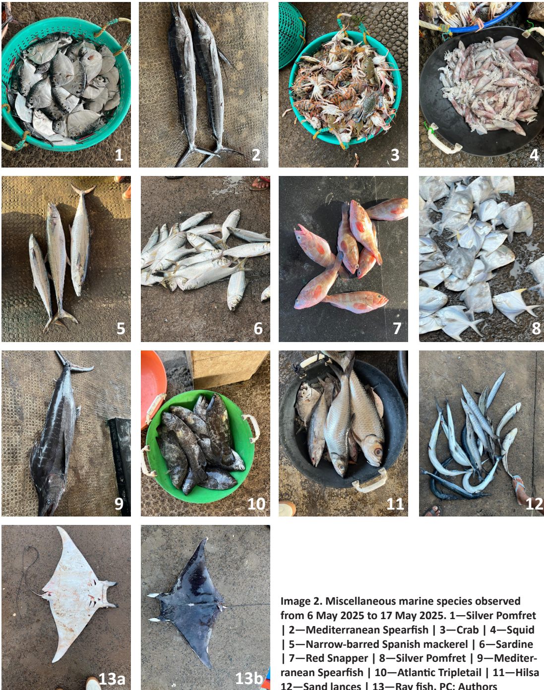
Image 2. Miscellaneous marine species observed from 6 May 2025 to 17 May 2025. 1—Silver Pomfret | 2—Mediterranean Spearfish | 3—Crab | 4—Squid | 5—Narrow-barred Spanish mackerel | 6—Sardine | 7—Red Snapper | 8—Silver Pomfret | 9—Mediterranean Spearfish | 10—Atlantic Tripletail | 11—Hilsa | 12—Sand lances | 13—Ray fish.