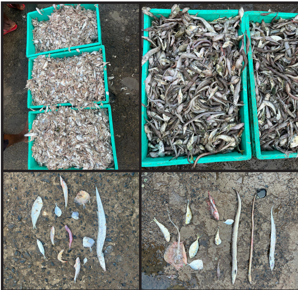
Image 3. Species observed in bycatch piles (05 May–17 May 2025).