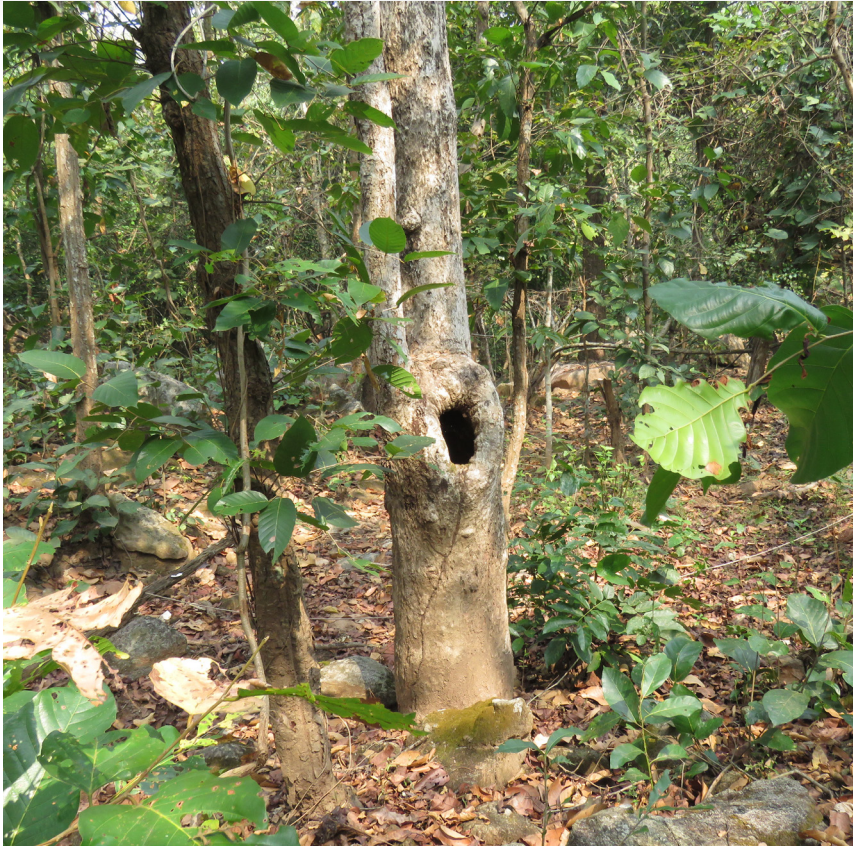
Habitat and host tree. © Bharati Patel.

1996; Bhandari et al. 2025), which continues to constrain the development of effective conservation strategies.