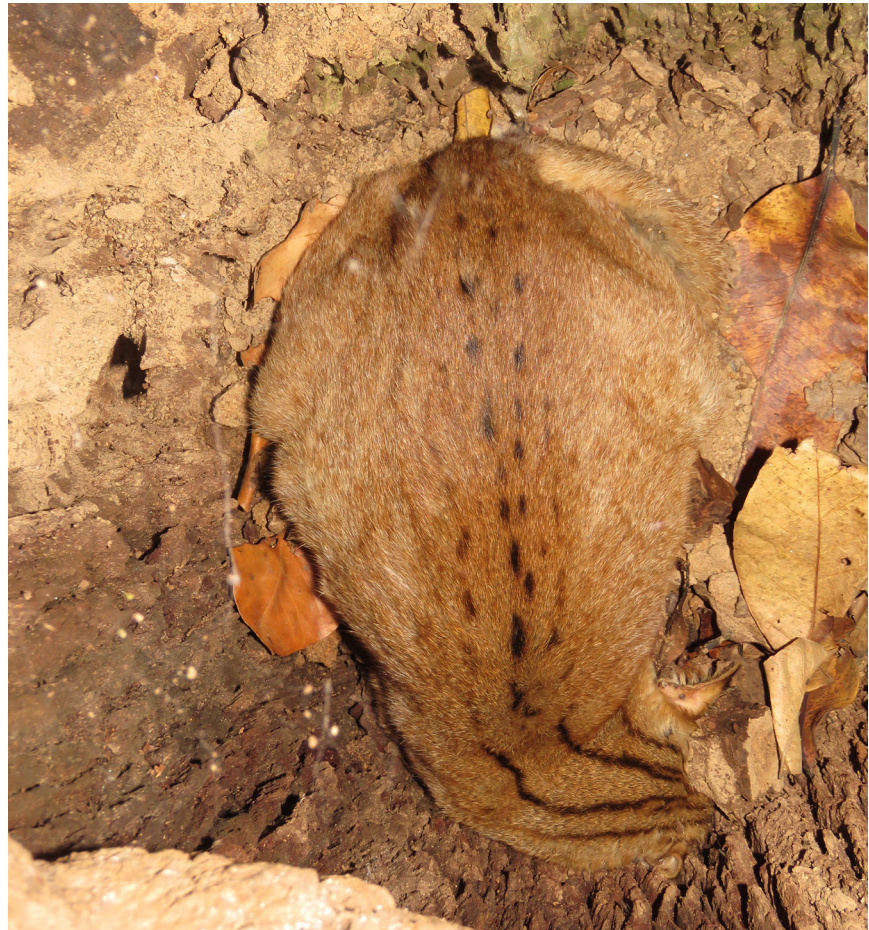
Rusty-spotted Cat in sleeping position in day den.

Camera-trap and photographic records provide critical